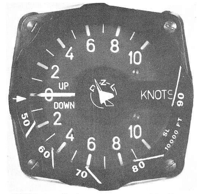
FIGURE 2. Perhaps a more practical arrangement. The inner edge of the verge ring is calibrated for sea-level, the outer edge for 10,000 ft. Approximate interpolation for other heights should be good enough. The calibration is for the "Standard Libelle."

FIGURE 1. A modified MacCready ring calibrated for heights of sea-level, 5,000 ft and 10,000 ft. The markings are on a clear plastic disc attached to the usual verge ring. Variometer details have been omitted for clarity. Speeds are in knots and the calibration applies to the maker's polar for the "Standard Libelle."