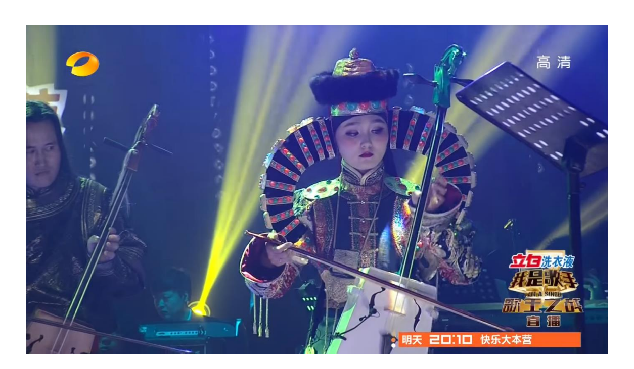
Figure 2Mongolian costumes and musical instruments on I am a Singer [Screenshot]. From "I am a Singer - Second season - 13th episode - Han Lei "Swan Goose" + "Walk to Horizon" + "Borrow Another 500 Years From the Heaven" [HunanTV Official 1080P] 20140404," by Ch