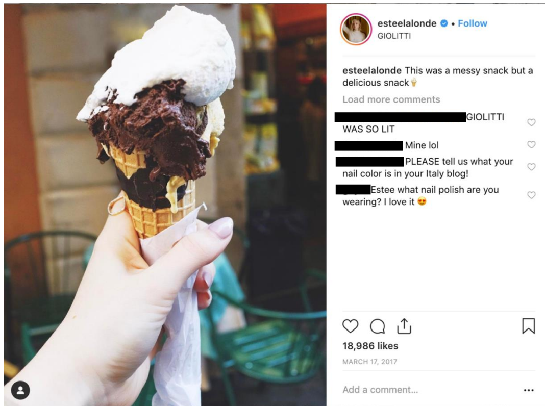
Figure 3 - Screenshot of Estée Lalonde's March 17, 2017 post from her account @esteelalonde, Instagram; Web. Taken January 22, 2019. https://www.instagram.com/esteelalonde/?hl=en