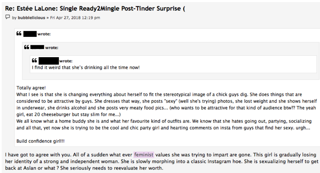
Figure 7 - Screenshot taken from Guru Gossip, a forum dedicated to gossiping about beauty influencers. Gurugossip.com. Web. Taken January 22, 2019. https://gurugossip.com/viewtopic.php?f=163&t=33628&p=3049741&hilit=feminist#p3049741