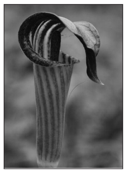
Figure 6. Jack in the Pulpit

- the embodied processes of consciousness - she notes that "Bergson emphasizes the need for introspection in order to recover the quality of experience. . . . He distinguishes two different selves, one the external projection of the other, inner self, into its spatial or social representation. The inner self is reached by deep introspection, which leads us to grasp our inner states as living things, constantly becoming ." <sup>37</sup>