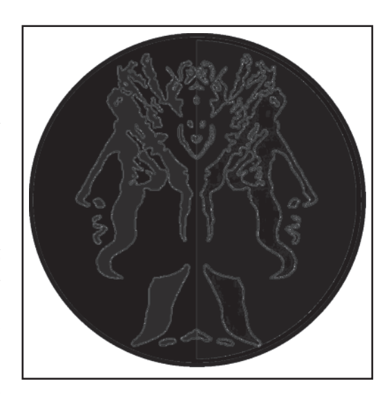
Figure 1. Janus, Roman god of portals, who looks both ways

To reflect both on our past and on our future, I want to honor the Roman god Janus, from whom we take the name of our first month in the Gregorian calendar -January. Janus is the god of portals, who looks both ways - both into the future and into the past, both into the space and out of the space (see Figure 1). I want to honor Janus especially because that is our way of being. We are both in our past and in our future. So I'm going to try to look both ways at once, in and out, up and down, at the objective and the subjective, all at once, a view from all directions, an omnidisciplined observation. When I am engaged in our community endeavors, the