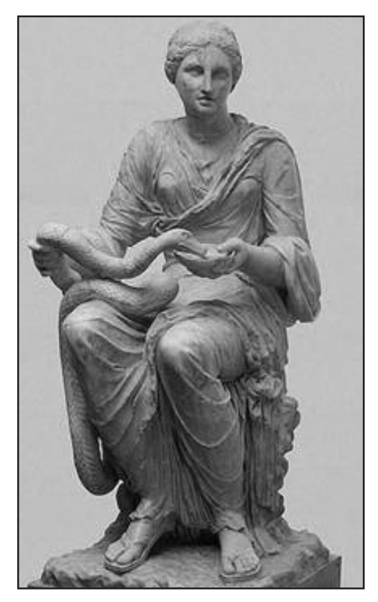
Figure 5. Hygeia, daughter of Asclepius, Greek Goddess of health

We need to play deeply with some puzzling distinctions, even deeper than analogy and metaphor. To my mind, objectivity and subjectivity are probably the most important, because this distinction keeps us from noticing that it is inadequate. The