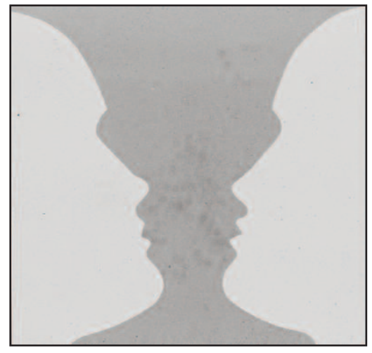
Figure 2. Face/goblet illusion, a figure/ground gestalt publicized by Danish psychologist Edgar Rubin in 1915

Consider another ambiguous figure: "My Wife and My Mother-in-Law" (see Figure 3). This is my favorite of the ambiguous