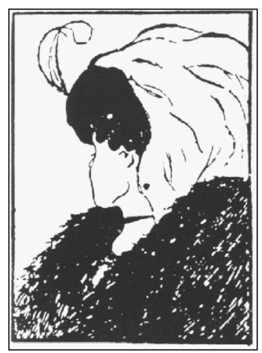
Figure 3. "My Wife and My Mother-in-Law" by British cartoonist W.E. Hill, from the American humor magazine Puck, Nov. 1915.

shape perception. Pre-existing knowledge shapes perception, expectations from higher brain centers, where so-called perceptual tokens such as "young" or "old" are encoded. But perceptual assessments are also dynamic. If all perceptual assessments relied only on top-down processes, they'd be too slow for survival. What we have, in addition, are bottom-up processes and sideways processes, all working together to provide perception.