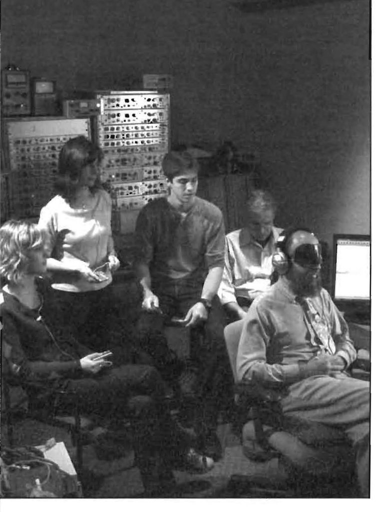
Figure 1. Laboratory arrangement