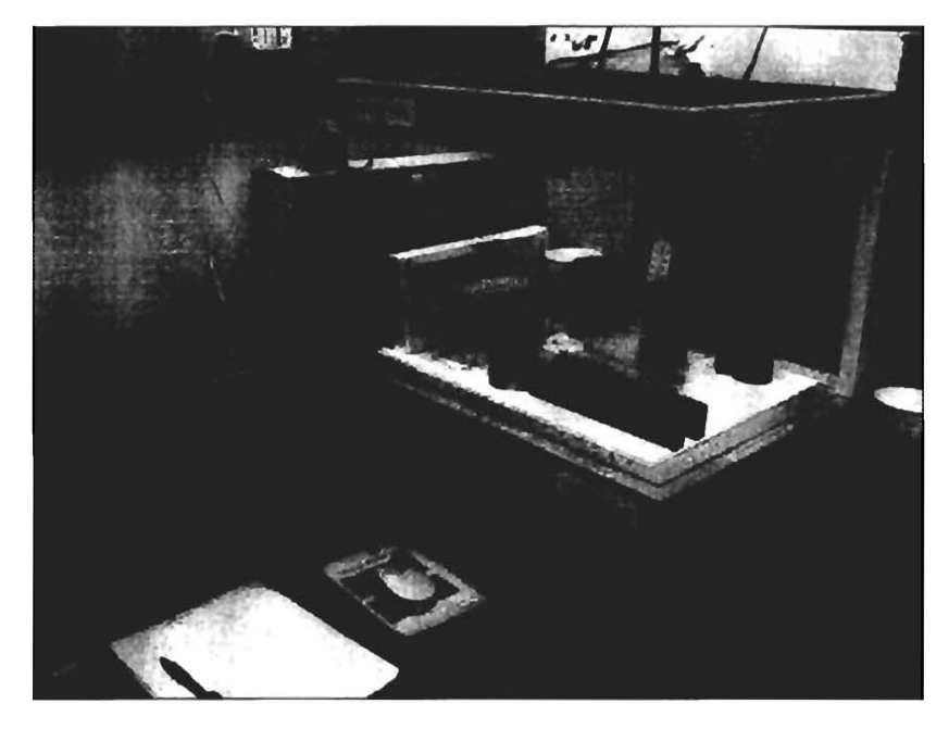
Figure 1. DigiBio's robotic device and computer for experiments in digital biology.

magician. We felt his credentials would allow him to address many aspects of the project we were undertaking.