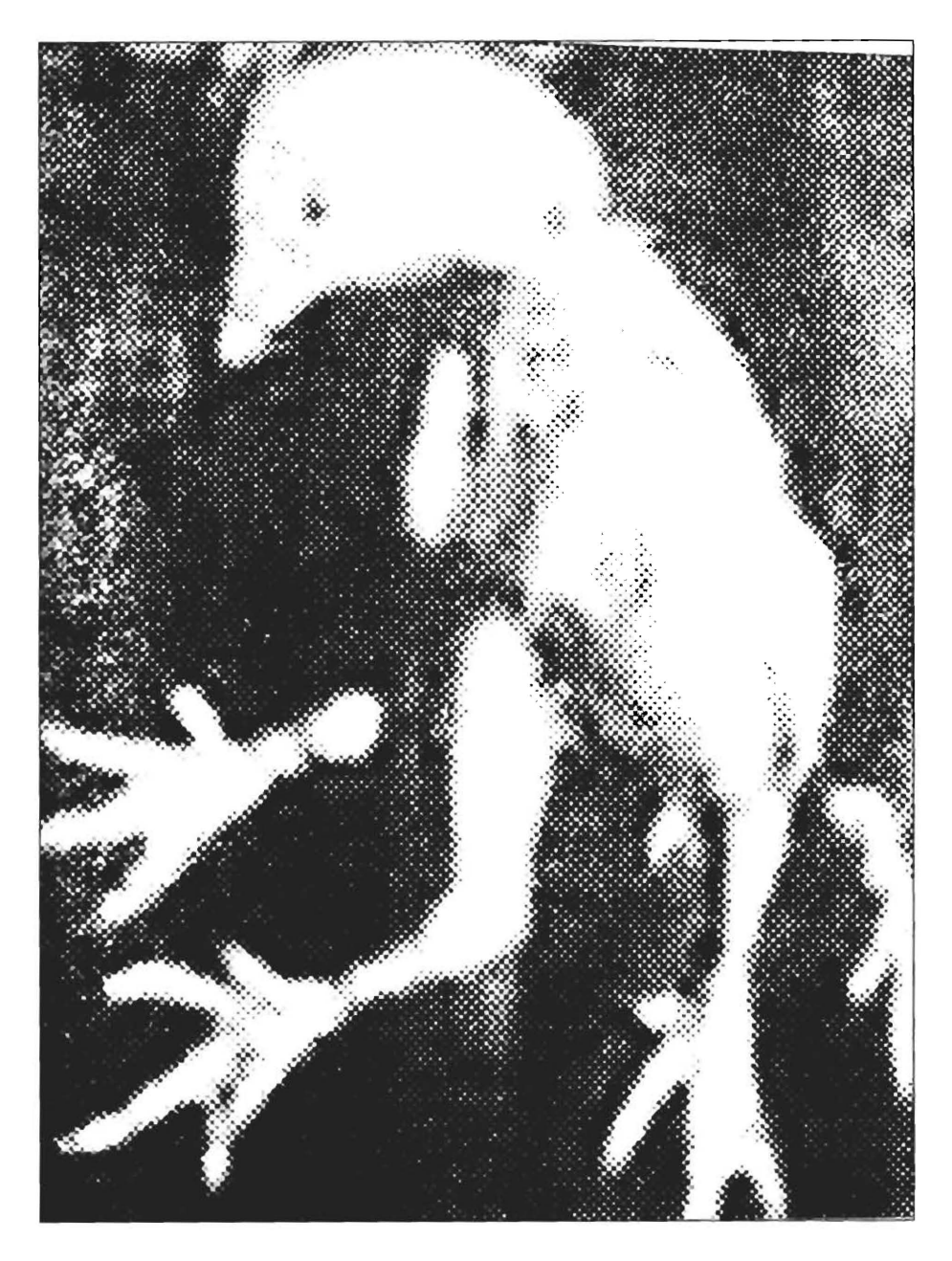
Figure 1. Chicken influenced by Duck energy.