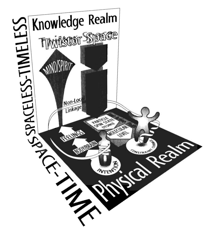
Figure 2. An illustration of how the life process relates to intention and constraints as implied by the model. The act of mental intention produces changes in one's brain/body which can often be experienced as "feelings." The target of intention can be one's self, another person, or any thing/object in the universe. The figure suggests how this non-local process can be understood in terms of standard physics concepts—the end effect is a change in physical constraints which alter the body's chemistry.

person, his body is able to respond to the pattern without having to deal with the toxicity of the active substance.