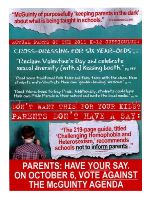
Figure 2: The Canadian Press. (2011, October 3). Retrieved March 3, 2014, from CBC News: http://www.cbc.ca/news/canada/toronto/story/2011/10/03/ontario-parties-campaign-minority274.html

The TDSB attempted to fill a significant gap in provincial curriculum by developing its own resources to include sexual and gender minorities (Matrim, 2014). One significant resource was called the Rainbow and Triangles: A Curriculum Document for Challenging Homophobia and Heterosexism in the K-6 Classroom (Toronto District School Board & Elementary Teachers of Toronto, 2002). A second revision was released nearly a decade later in 2011 under a new title Challenging Homophobia and Heterosexism: A K-12 Curriculum Resource (CH&H) (Toronto District School Board, 2011). The second edition of CH&H became a subject of political controversy during the Ontario provincial election in the fall of 2011. The Ontario Progressive Conservatives released a flyer during the campaign that claimed that this resource had gone too far. "Cross-dressing for sixyear olds", reclaiming Valentine's Day with a "kissing booth", reading "some traditional folk tales and fairy tales were all identified as problems.