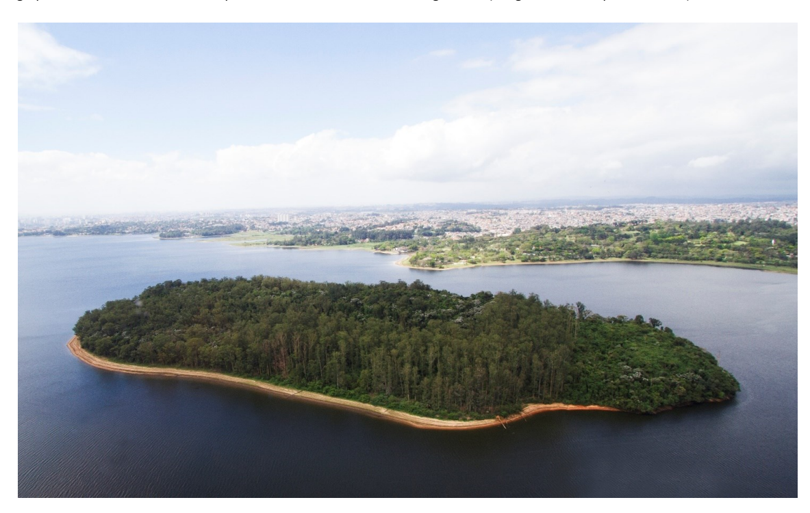
Figure 2. Ilha dos Eucaliptos, in the central part of the Guarapiranga reservoir, São Paulo, SP.