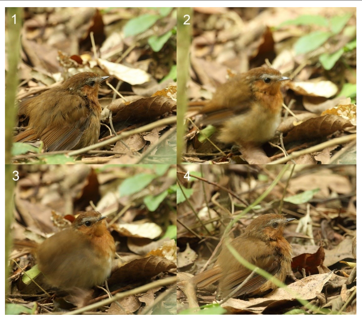
Figure 3. Male Rufous Gnateater performing the "broken-wing anti-predator distraction" display. Sequence of images: 1, 2, 3 and 4.

land is mostly covered by native forest remnants of Atlantic forest in middle and advanced stages of succession, as well as a small eucalyptus plantation that occupies about one-fourth of its area (Figure 2). Observations were made in native forest with a 18–20 m high canopy, some isolated and emerging eucalyptus, and a dense understory of shrubs, vines and fallen branches.