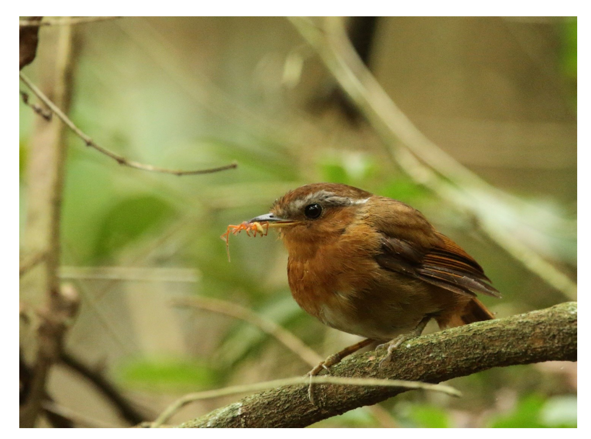
Figure 5. Male Rufous Gnateater with a spider (Anyphanidae) in its beak.

sources, Sick (1985) and Belton (1994), repeat the information in Sick (1964) and Belton (1985) respectively (Table 1, Appendix 1). No additional references were found in WikiAves or eBird.