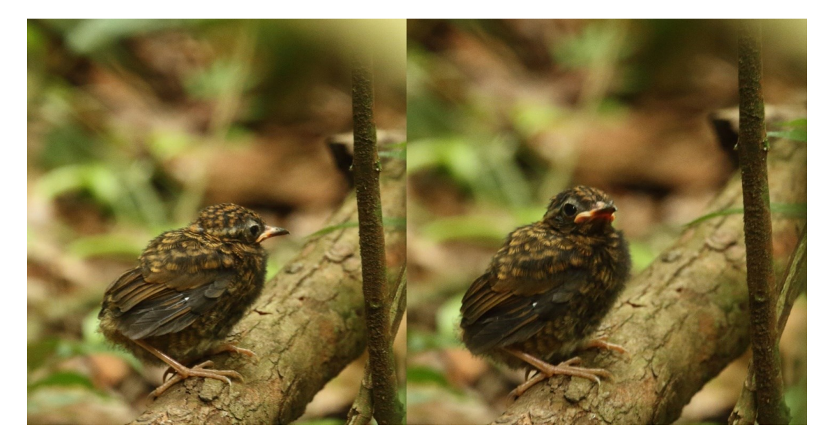
Figure 4. Young Rufous Gnateater with juvenile plumage.