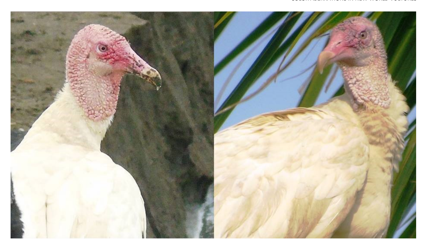
Figure 2. Lateral view of Coragyps atratus with ino aberration, Ostional, Guanacaste, Costa Rica, on 6 October 2018.

individual had a dirty white to light cream plumage; the soft parts of the body and tarsi were pinkish, and the irides had a normal pigmentation (Figure 2), which suggests that it was an ino aberration as well.