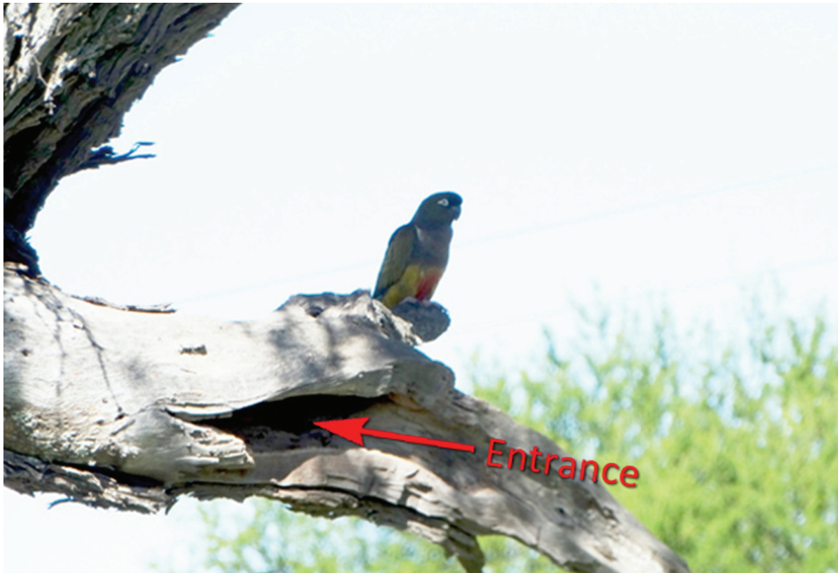
Figure 1. Adult Burrowing Parrot ( Cyanoliseus patagonus ) on the entrance of the cavity B occupied by the species nesting during the 2016 season in the Reserva Provincial Parque Luro, La Pampa, Argentina. Photograph: P. Orozco Valor (28 November 2016).