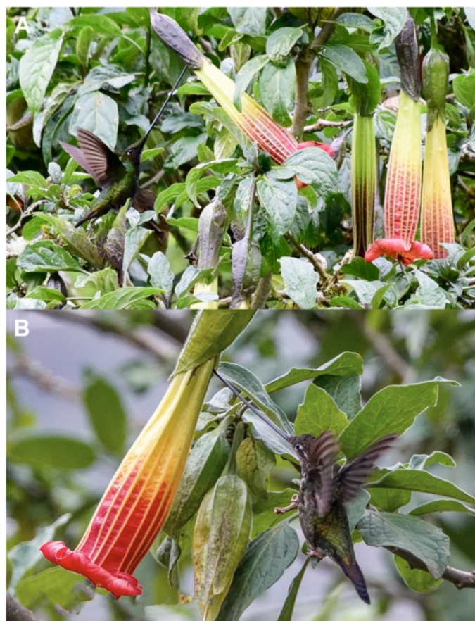
Figure 1. Sword-billed Hummingbirds robbing nectar from flowers of red angel's trumpet Brugmansia sanguinea in Napo Province, Ecuador, on 24 October 2017 (A) and 17 March 2018 (B).

In nearly all reports of nectar robbing by hummingbirds,