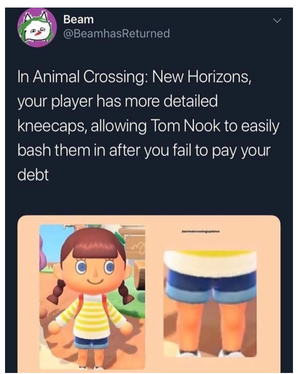
(Figure 5) a viral tweet about Tom Nook.

We have no way to know if, in the world of Animal Crossing , we are paying a fair price for our home, for our tools, for our material goods, as there are no other options. Capitalism teaches us all that wealth is deserved and that the wealthy are people who have worked hard. So, Animal Crossing generally, and Tom Nook specifically, may be the first time many people are confronted with the reality that maybe wealth is neither deserved nor fair . Could the world of Animal Crossing , therefore, be unintentionally waking up a generation of players to the evils of capitalism through Tom Nook?