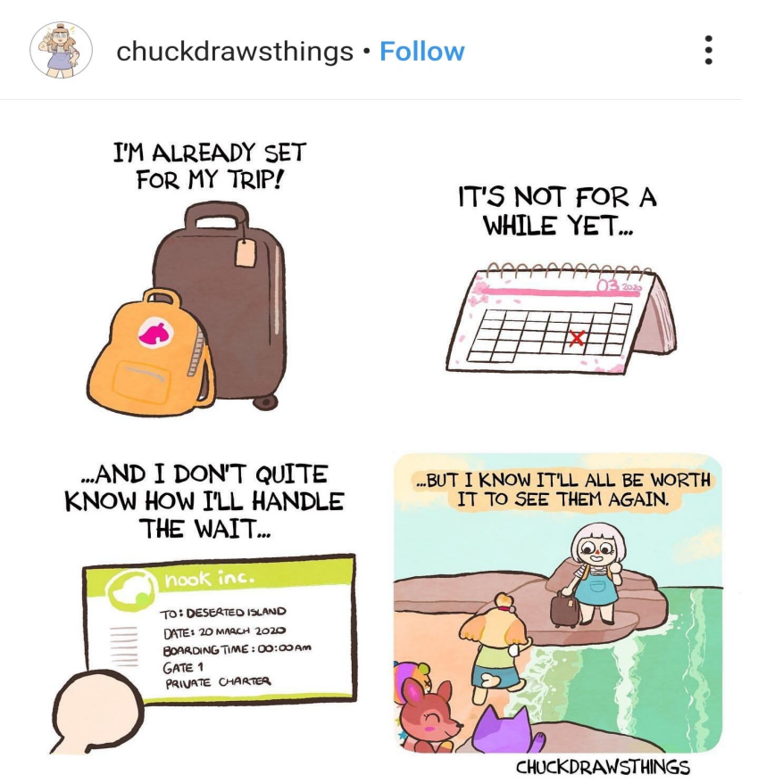
(Figure 2) Comic by Chuck Draws Things (Used with permission)

Animal Crossing is also substantially more affordable than any sort of vacation, and right now, due to travel restrictions, much more attainable. Increasingly, with mounting student debt and economic precarity, unless something dramatic changes many millennials (as well as many in gen Z) will never own homes, find non-contract or gig economy jobs, have families, retire, or do much travelling—but we do have video games. While video games may have seemed like a non-essential luxury product to previous generations, for many millennials such as myself, video games are one of the few things we can afford . As Dyer-Witheford and de Peuter have put it: