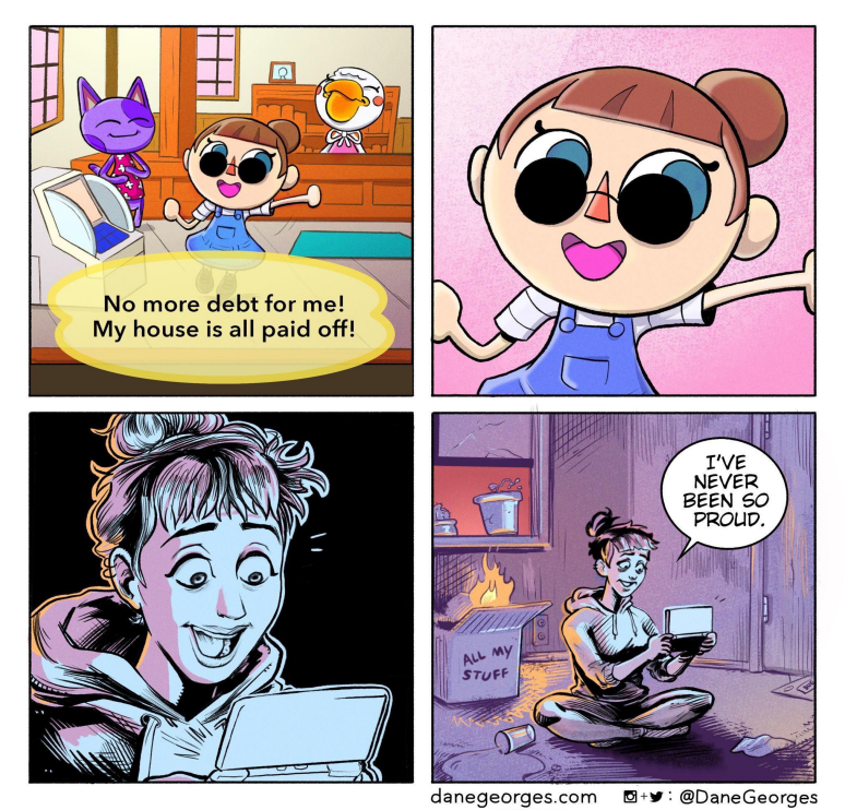
(Figure 7) A comic about paying off debt in Animal Crossing (Used with permission).