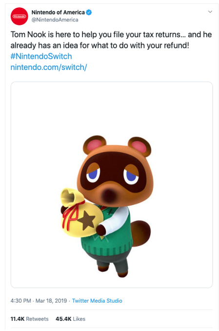
(Figure 6) a tweet about Tom Nook from the official Nintendo Twitter account