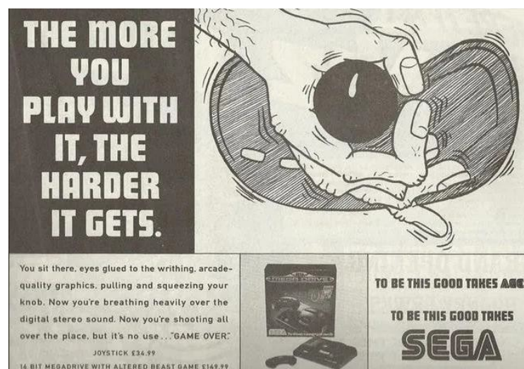
Figure 1.5. Sega mega drive advertisement mapping self-masturbatory phallic play and death to the joystick

Yet entering text into Animal Forest requires that players to navigate both phallic and clitoral analogues by pairing rhythmic button presses with rotating and flicking the joystick, a feeling of writing that is disruptive to historic narratives of writing as a strict analogue for cisgendered male sexual activity. As Phillips concludes, such observations are merely disruptive as they still perpetuate in a problematic gendering of gameplay and game hardware; however, given the largely heteronormative cisgendered rhetorics circulated about players, hardware, and writing, the feeling generated by Animal Forest's writing system presents an important rejection of these analogues.