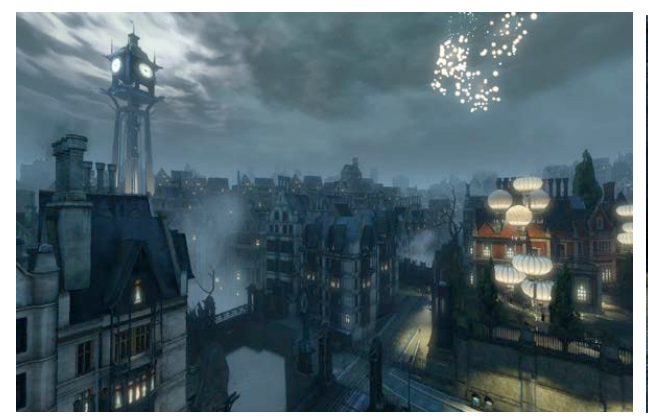
Figure 11 - A view from the rooftop of a building in the estate district. Despite civil unrest and plague, the upper class still manages to enjoy the exuberance of a masquerade ball within the fortified walls of the Boyle estate.