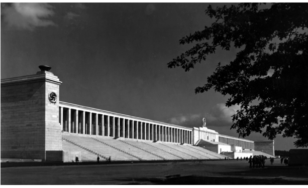
Figure 2 - The Zeppelin Grandstand, designed by Albert Speer, a part of the Nuremburg Rally