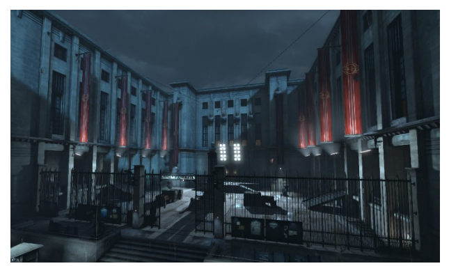
Figure 1 - The Office of the High Overseer