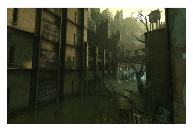
Figure 13 - Submerged warehouses and refineries litter the Rudshore Waterfront in the Flooded District, inhabited only by hostile river creatures and infected plague victims.