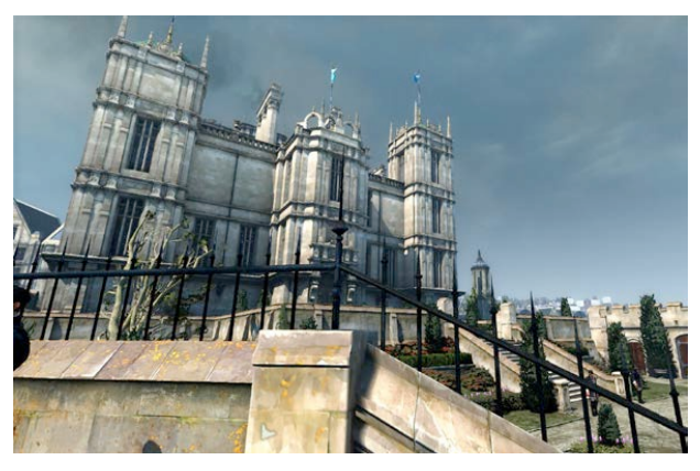
Figure 7 - Dunwall Tower in the opening prologue of the game. The player is unable to progress past the steel fence, but is allowed to explore a small area outside.