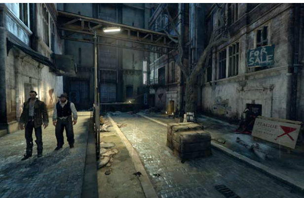
Figure 12: The streets of the Distillery District as seen by the player in an earlier mission, depicting the living conditions of the lower class.

the common citizens. Corvo's visit to the Estate District takes place immediately following a long period spent in the slums and ruined districts of Dunwall, forcing a juxtaposition between the two areas that acts as a resource for the player – an ethical agent (Sicart, 2008) – to reflect upon the nature and ethics of their acts within the gameworld. This is further reinforced by the game's conceptual influence of "the contrast in every city between its logical renaissance structure and the chaos that lies underneath, that nobody sees" (Antonov & Zeller, 2012, p. 170).