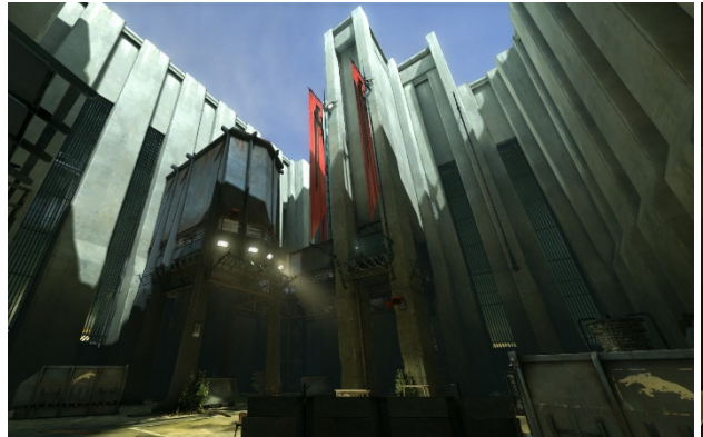
Figure 3 - An Internal courtyard of Coldridge Prison