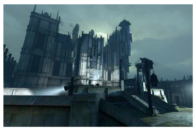
Figure 8 - Dunwall Tower following Hiram Burrows' rise to power. The lighting serves to emphasise the building's menacing visage.