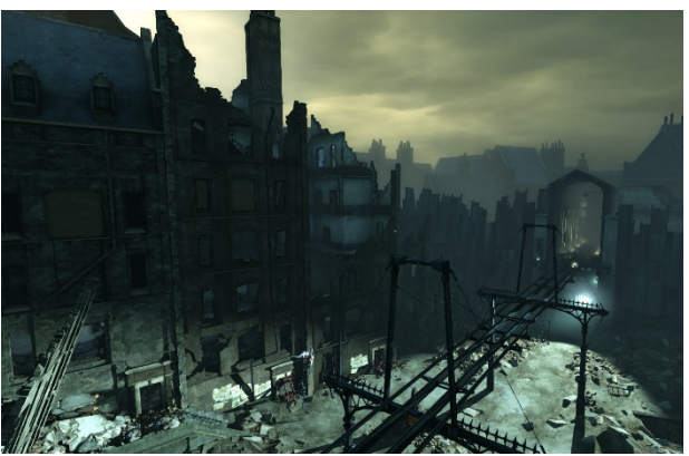
Figure 14 - Ruins in the condemned Flooded District, where very few survivors hide from the City Watch. The train tracks are used to transport and dump the bodies of plague victims.

choices. In low chaos, the ending shows Emily Kaldwin rising to the throne as a benevolent and loved ruler, bringing the city of Dunwall back from the brink of destruction into a golden age as a cure for the rat plague is developed. Conversely in high chaos, Emily will either begin a sadistic reign of terror influenced by Corvo's violent actions or be absent completely if she died in the final mission. In this case the ending shows the rest of Dunwall being decimated by the plague as Corvo flees the city on an outbound ship. The horrors of the plague experienced in the Flooded District provoke moral reflections on the consequences and influence of the player's actions. Fraser (2015) notes that "the dimension of exploration is one way in which the visual or surface content of ruins-in-games moves beyond the symbolic to shape activities that may impact or facilitate gameplay" (p.26); in this instance, we argue that it impacts the player's role as an ethical agent. Architecture in Dishonored works to shape the player's ethical agency through their interactions and observations in Dunwall by providing motivation (or deterrence, depending on their moral code) to redeem the city and save the lives of the citizens of Dunwall.