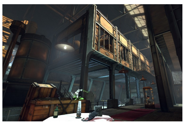
Figure 6 - The interior of Sokolov's Safehouse. The warehouse has been repurposed, and the new steel structure appears like a foreign life form tentatively hovering within the space.

in the context of our subsequent assertion that architecture is reflective of the morals of those who build and dwell within it. The following architectural examples in Dishonored demonstrate how architecture is used as visual metaphor for important characters to convey information about the game's main characters, similar to how architecture is utilized in other visual media.