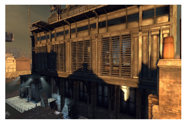
Figure 5 - The external façade of Sokolov's Safehouse. The steel structural addition is attached to the original brick façade by enormous metal corbels, casting it in shadow while the addition is allowed full solar access.