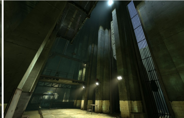
Figure 4 – An internal hallway in Coldridge Prison.