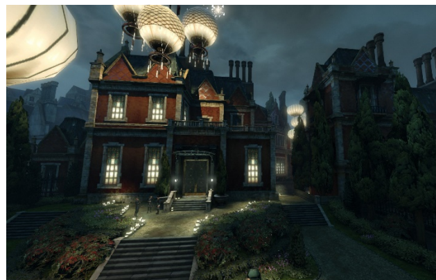
Figure 9 - The exterior Facade of the Boyle Mansion