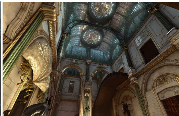
Figure 10 - The intricate Renaissance-styled architectural detailing within the decadent Boyle mansion