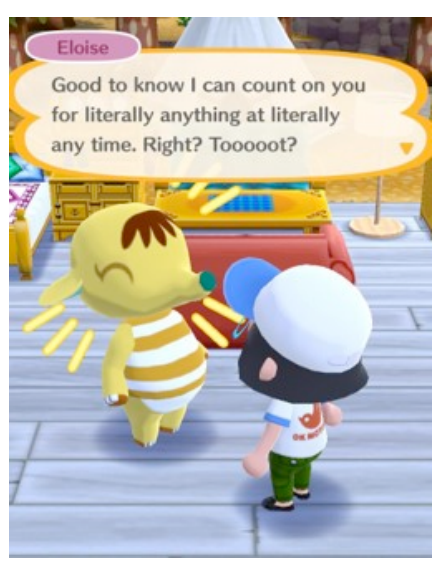
Figure 5 – I cannot help but be reminded of Amazon CEO Jeff Bezos' infamous push for 'humans as a service'.

labour-like chores and a steadily-increasing ratio between wait-time and play-time to make the game actively less enjoyable to play unless one spends money. It is interesting that this disrupts even the already-problematic idea that mobile games are meant to be played in the tiny gaps we have between our regularly-scheduled periods of work. A player cannot pick up Pocket Camp where they left off like they might a game of Solitaire . Instead, the game asks that players schedule their lives around it unless one is able to pay for the privilege of escaping those parts of the game that are most labour-like.