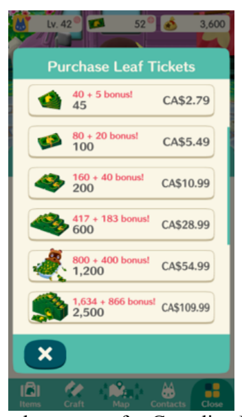
Figure 4 – The going exchange rate for Canadian Dollars to Leaf Tickets

Enter Leaf Tickets, a new currency that is distinct from Bells both in what one buys with it and in how one earns them. Put simply, the primary purpose of Leaf Tickets is to eliminate any of the above wait times. The chief way of acquiring Leaf Tickets is by purchasing them with real money via credit card (see Figure 4 ). If the apple trees simply need to bear fruit this second, you can pay. If you want to skip right to that furniture being built, you can pay. Even if you lack the requisite materials to build a particular object, the crafter can spin Leaf Tickets into wood, and metal. If one is willing to pay, most of the game's repetitive chores (and with them, most of the game's mechanics) become unnecessary.