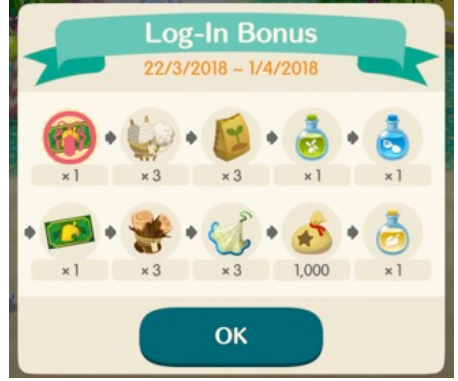
Figure 6 – An example of 10 days' worth of log-in bonuses. The game is clearly happy to reward players for their engagement, however modestly.

Consider, once again, some key points about Pocket Camp 's gameplay. If a player is willing to wait for objects to be built, they need not spend Leaf Tickets. This in itself is not a major revelation. But in actual fact, if a player is patient enough, they need not even harvest fruit, catch fish, or befriend animals. With the resources the player is given at the start of the game along with the daily log-in bonuses one receives, a player could access most of the game without ever taking part in the game's repetitive, labour-like chores (see Figure 6 ). Since Pocket Camp turns natural resources and indeed friendship into currencies, the player can acknowledge this and refuse to receive that 'waged labour' in kind, and instead opt to wait for the game to give them enough materials to continue.