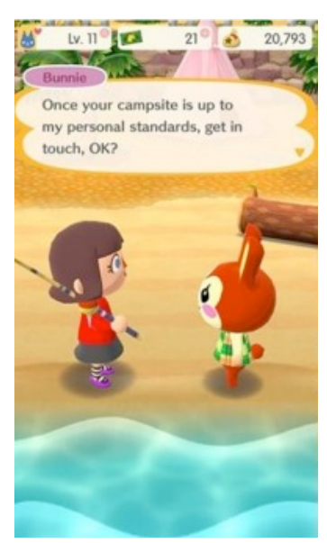
Figure 3 - Friendship is given a materialistic twist in Pocket Camp

This, then, is a basic summary of the gameplay in Pocket Camp : players collect goods to give to animals for money, materials, and friendship points and these resources are converted into furniture which satisfies the player's aesthetic sensibilities while also leading to the chance for more resources. This cycle continues until the player either gets bored or there are no more animals to befriend, although Nintendo is patching the game constantly to add new animals as well as special time-sensitive events that the player can partake in. Playing regularly is also incentivized through small rewards for simply logging in each day, so player retention is clearly a design goal. With the core gameplay explained, we are now ready to move on to the matter of time in the game.