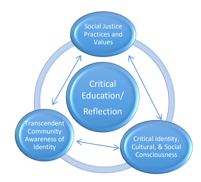
Figure 2. Process of Mestiza Consciousness emergent from LatinX community college critical social justice servicelearning program data. This chart shows the recursive flow of critical awareness and social justice action centered around critical education.

Critical educational methods focused specifically on identity, culture, society, and empowerment were key from the beginning, and they guided the structure of the program, including motivational and organization elements. As such, participants' assessments of their own critical awareness had primary significance in this analysis. In addition, the culminating element of the process of Meztiza consciousness (Anzaldúa, 1999), transcendent awareness of identity, wherein critical awareness is raised to a transcendent perception of the self and the "other," was also identified as a defining element success in the program. Finally, social justice practices and values were applied by program designers to guide the structure of the process in ways unique to the community college learning environment and tied to a direct relationship with critical educational methods. The following sections present a record of the responses organized into these three principal themes and their supporting sub-themes, listed above.