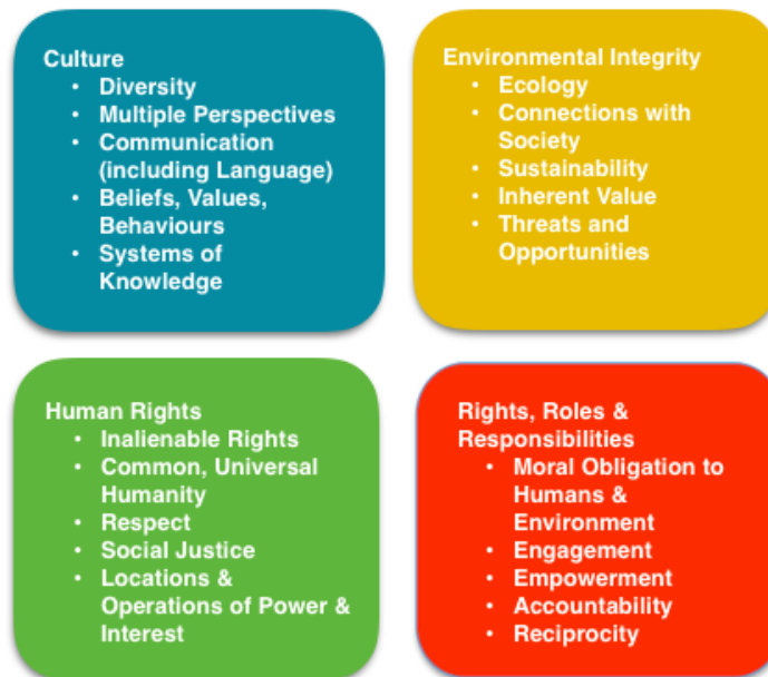
Figure 5 Our new framework to describe a global citizen. This framework depicts the necessary interdisciplinary knowledge and skills as well as the process that individuals progress through during their development. The boxes beneath the graphic provide more information for each overarching topic.