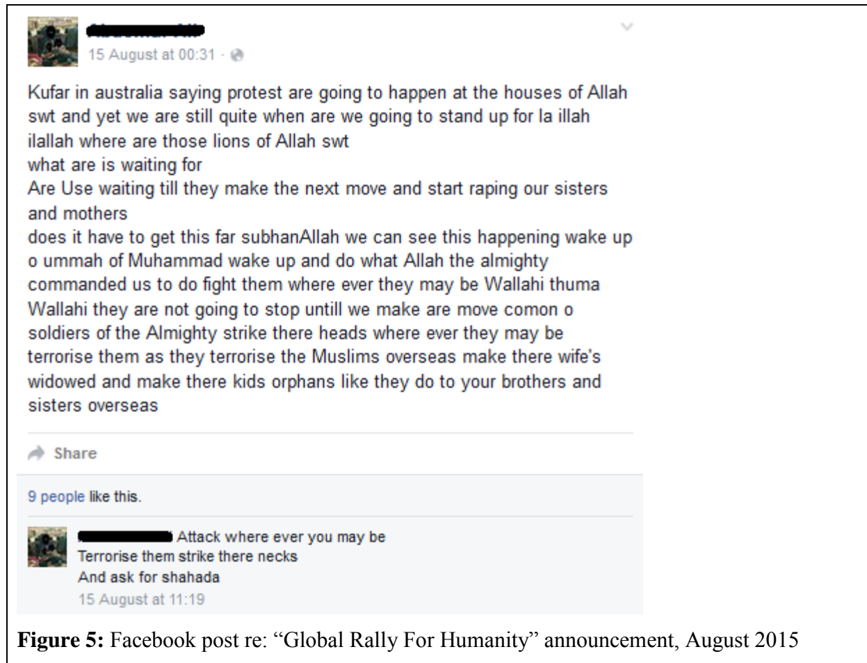
Figure 5: Facebook post re: “Global Rally For Humanity” announcement, August 2015