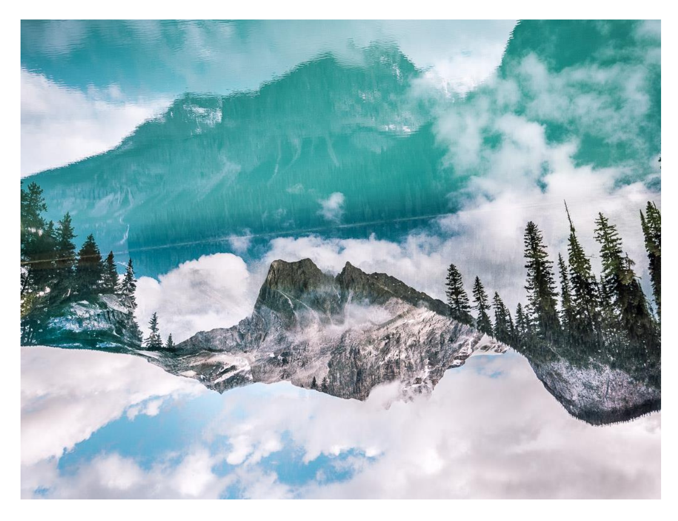
Her(e) on the Land #68