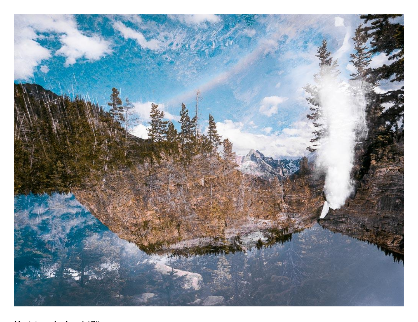
Her(e) on the Land #70