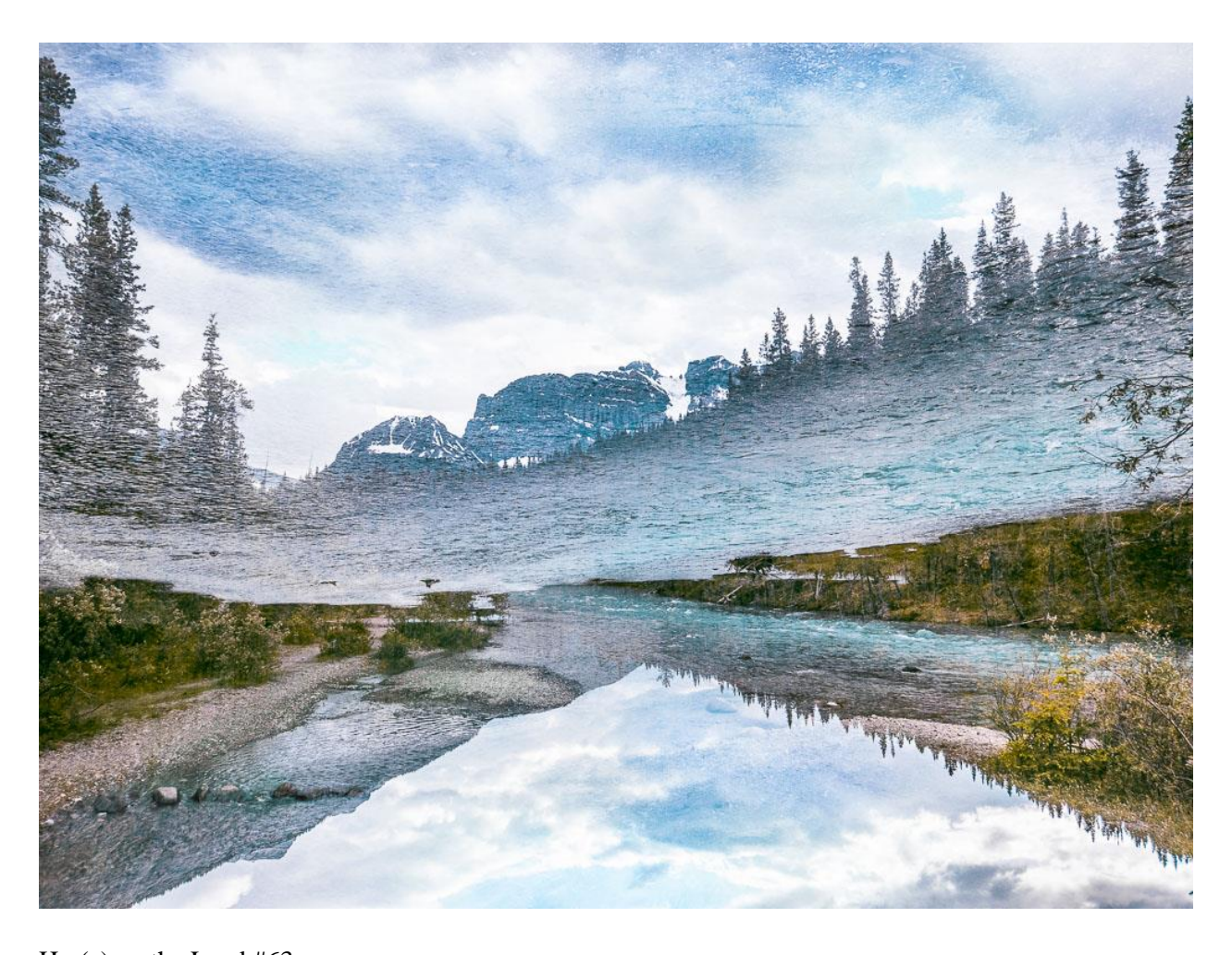
Her(e) on the Land #63