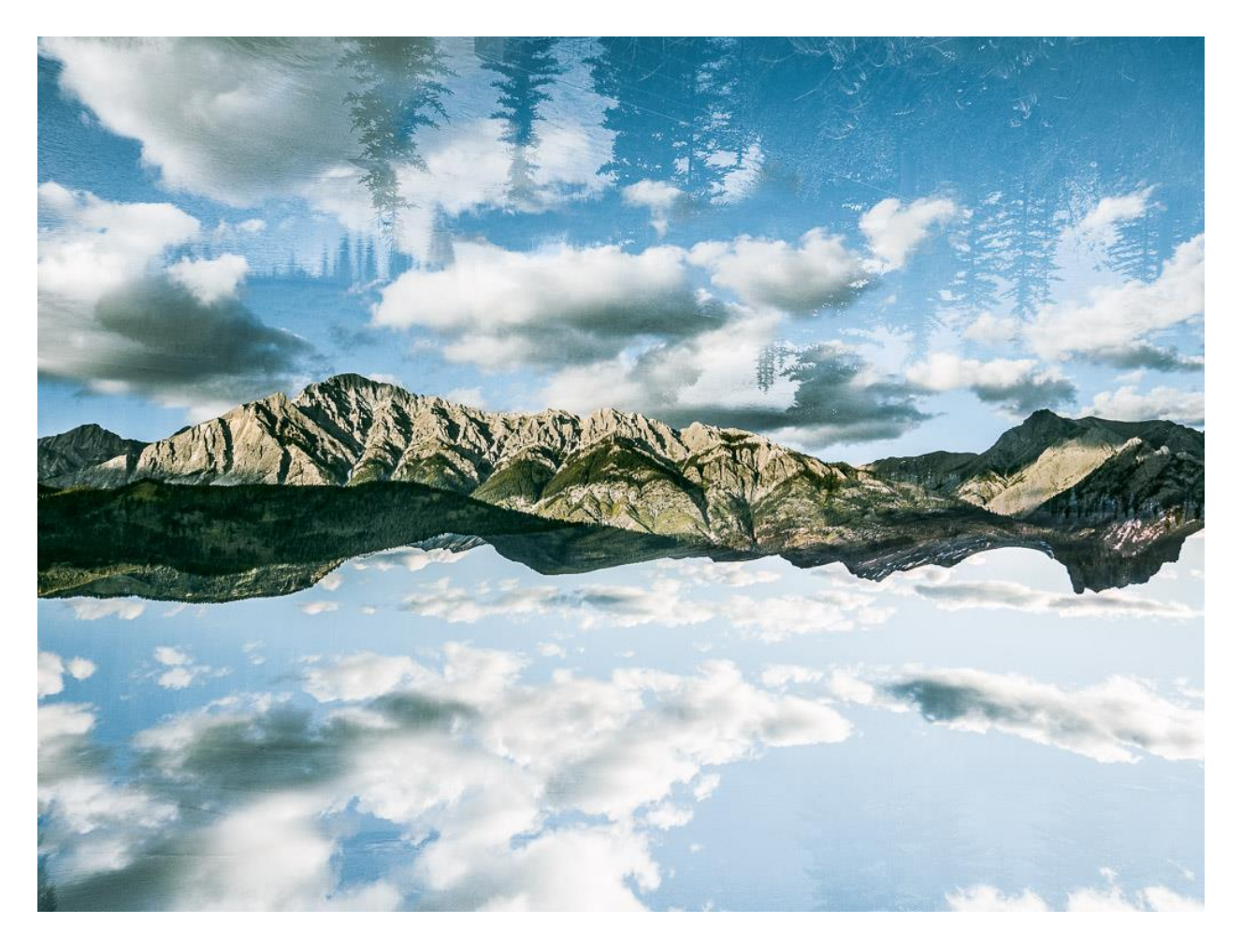
Her(e) on the Land #59