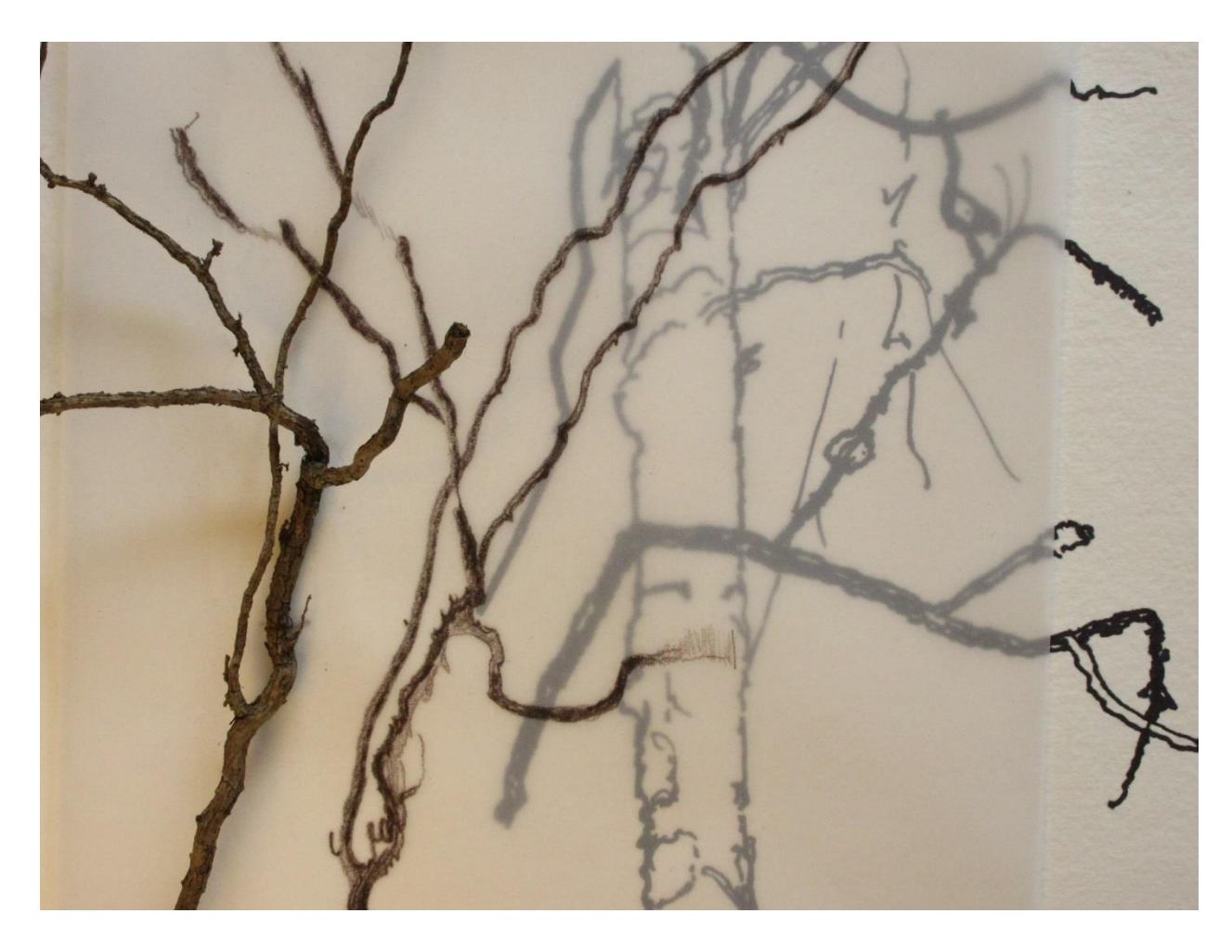
Root Shadows, 2021 - Ink on watercolour paper; tree roots, coloured pencil on velum