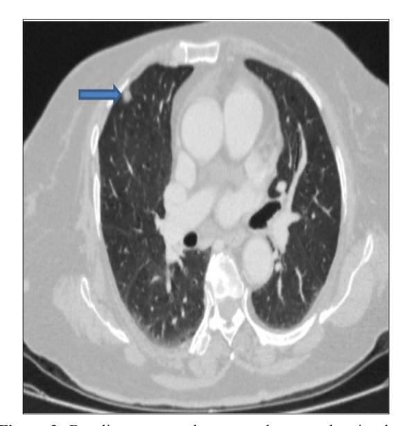
Figure 2: Baseline computed tomography scan showing lung metastasis (blue arrow)