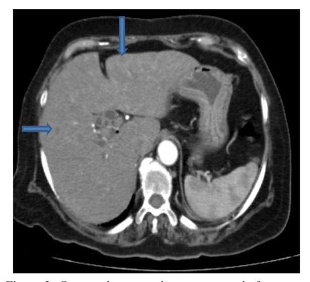
Figure 3: Computed tomography scan repeated after a year showed the presence of liver metastasis (blue arrows) consistent with disease progression

Her blocked stent was replaced and she was discharged from the hospital in a stable clinical condition with improving liver function tests. She passed away in December 2015, 16 months after diagnosis and 12 months of no treatment for primary disease.