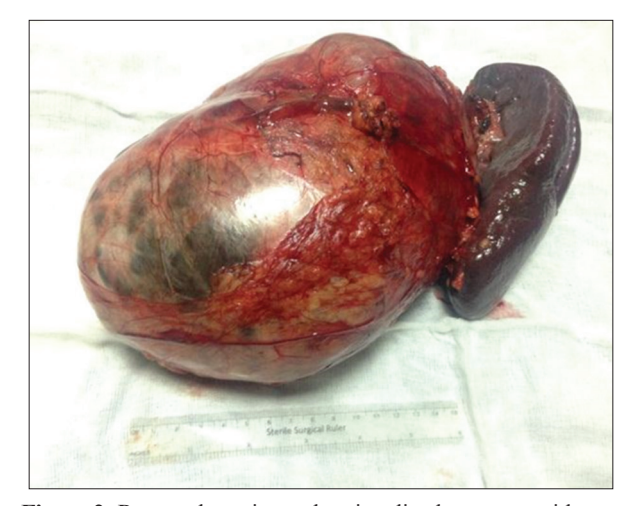
Figure 2: Resected specimen showing distal pancreas with cyst and spleen, removed in toto