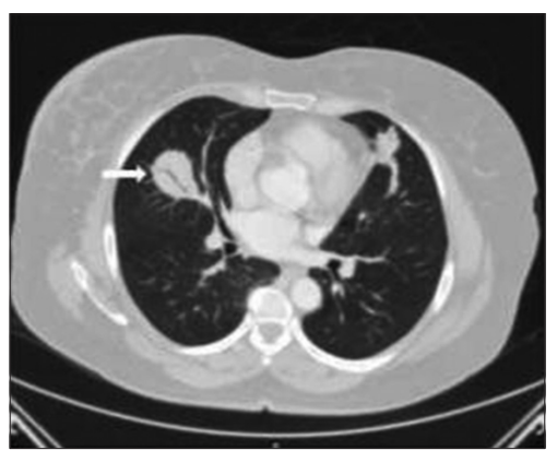
Figure 2: Bilateral perihilar consolidations with air bronchograms