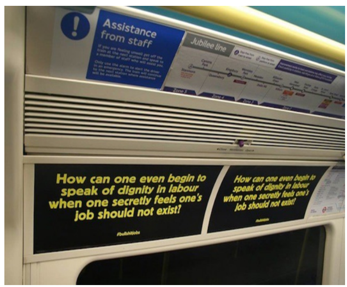
Figure 1: Photo from London Underground, 2015 (England, 2015).

Graeber conducted substantial qualitative research that enriches the text with many quotable testimonies and quite a few great stories. He analysed more than 250 thoughtful and detailed responses resulting from a Twitter request