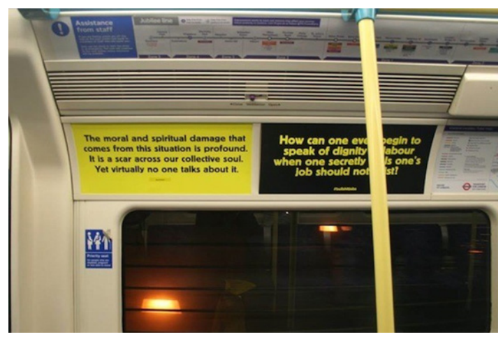
Figure 2: Photo from London Underground, 2015 (England, 2015).

The psychological aspects of BS jobs can be devastating, inducing "feelings of hopelessness, depression, and self-loathing" (134). Graber devotes two chapters to this "spiritual violence" (chapters 3 & 4) that is "directed at the essence of what it means to be a human being" (134). We do know from the popular content theories of motivation (Maslow; Herzberg; and McClelland) and the philosophical assumptions of leadership (McGregor's Theory Y) that people are not inherently lazy and do want to contribute something meaningful to society.