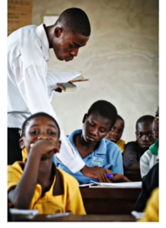
Figure 8: Omega School marketing collateral.

Most importantly, actually, others have followed in this way now. So, they say the Rising Academies which started in Sierra Leone, they were clearly absolutely inspired by my work. And now they're partnering, they merged with Omega Schools in Ghana. And Bridge International Academies, the most famous of these chains, they were inspired by my work. The co-founder of them came to visit me in Newcastle after I published The beautiful tree – I won a prize, the last chapter of The beautiful tree is actually a prize-winning essay in 2006. The co-founder came to visit me in Newcastle and discussed the idea of creating chains of schools. So, I've certainly inspired a lot of these very successful projects around the world. And I'm happy to have done that.