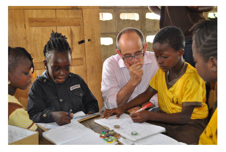
Figure 9: Omega primary students doing mathematics.

Most importantly, actually, others have followed in this way now. So, they say the Rising Academies which started in Sierra Leone, they were clearly absolutely inspired by my work. And now they're partnering, they merged with Omega Schools in Ghana. And Bridge International Academies, the most famous of these chains, they were inspired by my work. The co-founder of them came to visit me in Newcastle after I published The beautiful tree – I won a prize, the last chapter of The beautiful tree is actually a prize-winning essay in 2006. The co-founder came to visit me in Newcastle and discussed the idea of creating chains of schools. So, I've certainly inspired a lot of these very successful projects around the world. And I'm happy to have done that.