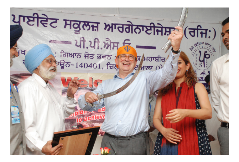
Figure 7: An event by the Punjab Private Schools Organisation with James Tooley.

The guestion I have - and I don't know the answer, so this is a genuine guestion; and I would like to know the answer to this, and if I had more time for research, it would be one of my research topics - is: The Punjab government closed more than 2,000 schools, what happened to those children afterwards? And is it possible that as those children were probably out of school for quite some time, they may have gone into government schools? Is it possible that they then drifted back to newly-opened private schools? And actually, the 2,000 schools that were closed, probably led to a net closing of none, or only a few? I don't know, but that's my assumption. Because those kids, they've got to go somewhere, haven't they? Their parents clearly have demonstrated that they want to pay, they're happy paying a small amount for education. That's why they're in the low-cost private schools and low-cost private school entrepreneurs have demonstrated that they want to open these schools. So the entrepreneurial spirit is still alive. As I said, I don't know. Maybe the authorities would not let this happen, in which case you have lots of kids out of school. My guess is that some of those schools reopened.