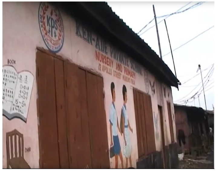
Figure 5: Ken Ade Primary School, Makoko shantytown, Nigeria.