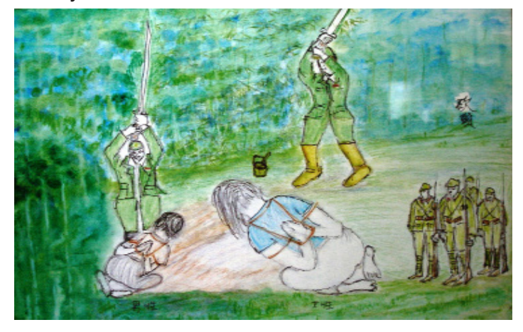
Figure 6: Civilian atrocities. A young artist's memory of civilian slayings, preserved in paint: acts such as these hastened the surrender.