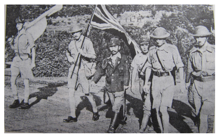
Figure 3: Ford Factory Surrender. February 15, 1942: General Percival (extreme right) arrives at the Japanese military headquarters, in the Ford motor factory, to sign the surrender. Major Cyril Wild (extreme left) carries a white flag.

Those immediate legacies in 1942 included internment and obeisance; the museum displays images of civilians bowing to the occupying forces. There are images also of the inevitable slaughter and torture, by bayonets directed even at infants and by slivers of steel probed under fingernails during interrogation by the Kempeitai, the Japanese internal security agency.