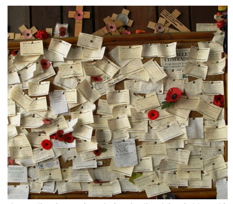
Figure 4: Chapel notes. The notice board at Changi chapel; visitors with a connection to former prisoners of war leave messages every day.

The major centre of incarceration for the Armed Forces taken prisoner was Changi. According to The Changi Book, published by the University of New South Wales Press in collaboration with the Australian War Memorial (Grant, 2015, p. 16), its various barracks and the gaol itself over the war years held an accumulated total of 87,000 Allied prisoners; 850 of them died there. They were hungry, they were bored, and they were frequently abused on work parties for the Japanese war effort. It has become the most popular site of all for contemporary reflection, as demonstrated by the hundreds of messages left on its notice board by visitors with POW connections.