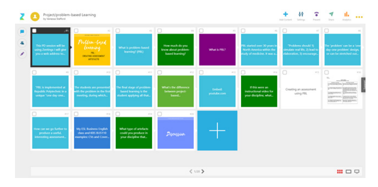
Figure 2: Your slides displayed in an easy to manage format.

My first professional development workshop using Zeetings was held online, using Zoom, in September 2018. The topic was 'problem-based learning' and was open to any academic to attend. My primary goal was to introduce this method of instruction to my academics. My secondary goal was to introduce them to Zeetings. There were two reasons for this. Firstly, I simply hoped that they would