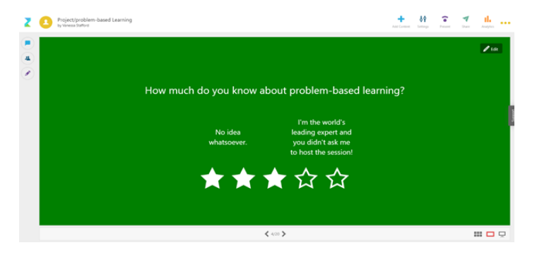
Figure 3: The first embedded activity slide was a benchmarking question.

At the end of this lesson, the participants all expressed their enjoyment of the lesson and of the interactive nature of Zeetings. This experience of a one-hour, online, professional development workshop with academics, confirmed for me that using EdTech tools such as online quizzing and polling, increases motivation for learning and allows deeper engagement with the content.