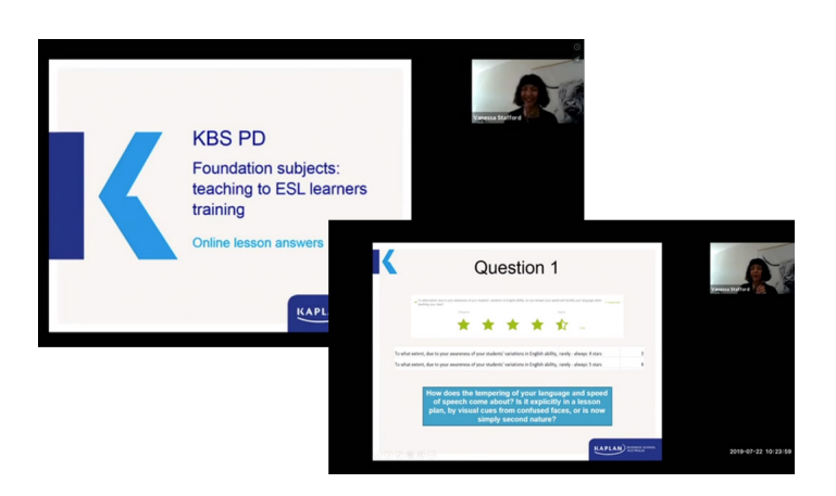
Figure 5: Flipped classroom part 2 – live session webinar screenshots.