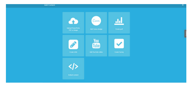
Figure 1: Adding content to your presentation - selecting an interactive slide.

Creating these deeper learning opportunities aligns with the company's goal to "transform presentations from oneway monologues into two-way conversations" (Zeetings, 2015). It is this mention of 'conversations' that inspired me to use the product because the learning benefits of having a two-way conversation with our students and workshop participants are well supported by learning science data. Gamification in online learning has been proven to increase motivation for learning and higher quality learning outcomes (Tan et al., 2016). In a recent study that assessed students' views on one gamification example, inclass, online polling activities, it found the students had an overall positive feeling towards these learning opportunities in three areas of study: behaviour-related engagement, emotion-related engagement, and cognitive-related engagement (Noel et al., 2015). Specifically, students who used the online polling during their lessons reported four positives: an increase in participation due to the anonymity of the exercise; increased enjoyment of the lesson; a deeper connection to the class; and an increase in understanding of lesson content (Noel et al., 2015). It was with two goals in mind: increased motivation for learning and better-quality learning outcomes, that I incorporated Zeetings into my online academic professional development workshops.