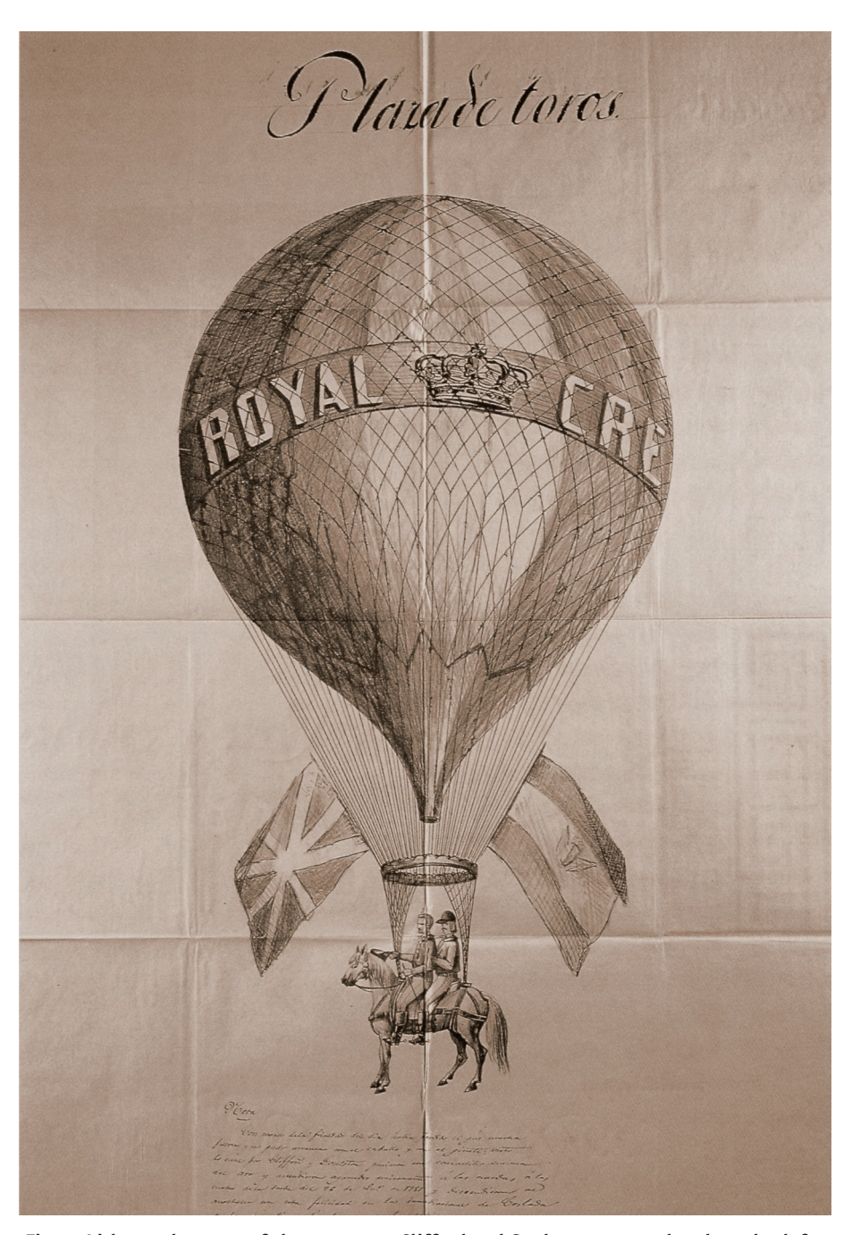
Fig. 1: Lithograph poster of the aeronauts Clifford and Goulston mounted on horseback for the event which was supposed to take place on January 26th, 1851. Biblioteca Nacional, Madrid (Sección de Fotografía, Servicio de Estampas y Grabados).