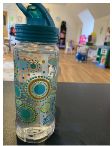
Figure 1: The Coronavirus bottle

(Figure 1). As she showed it off to her friends at the snack table, one of the children Alex (4.5-year-old) mentioned how the circles looked like toe Coronavirus. She smiled and agreed, and the children pointed to the circles and showed it to each other. I watched as they found something to smile about even in these circumstances. The realities of the outside world and the realities of our pod world were inextricably entangled yet they were so different because of the children and the way they chose to see the world. In many instances after this, I noted how the children brought in things that looked like the virus.