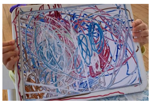
Figure 3: Angela's drawing of the Coronavirus