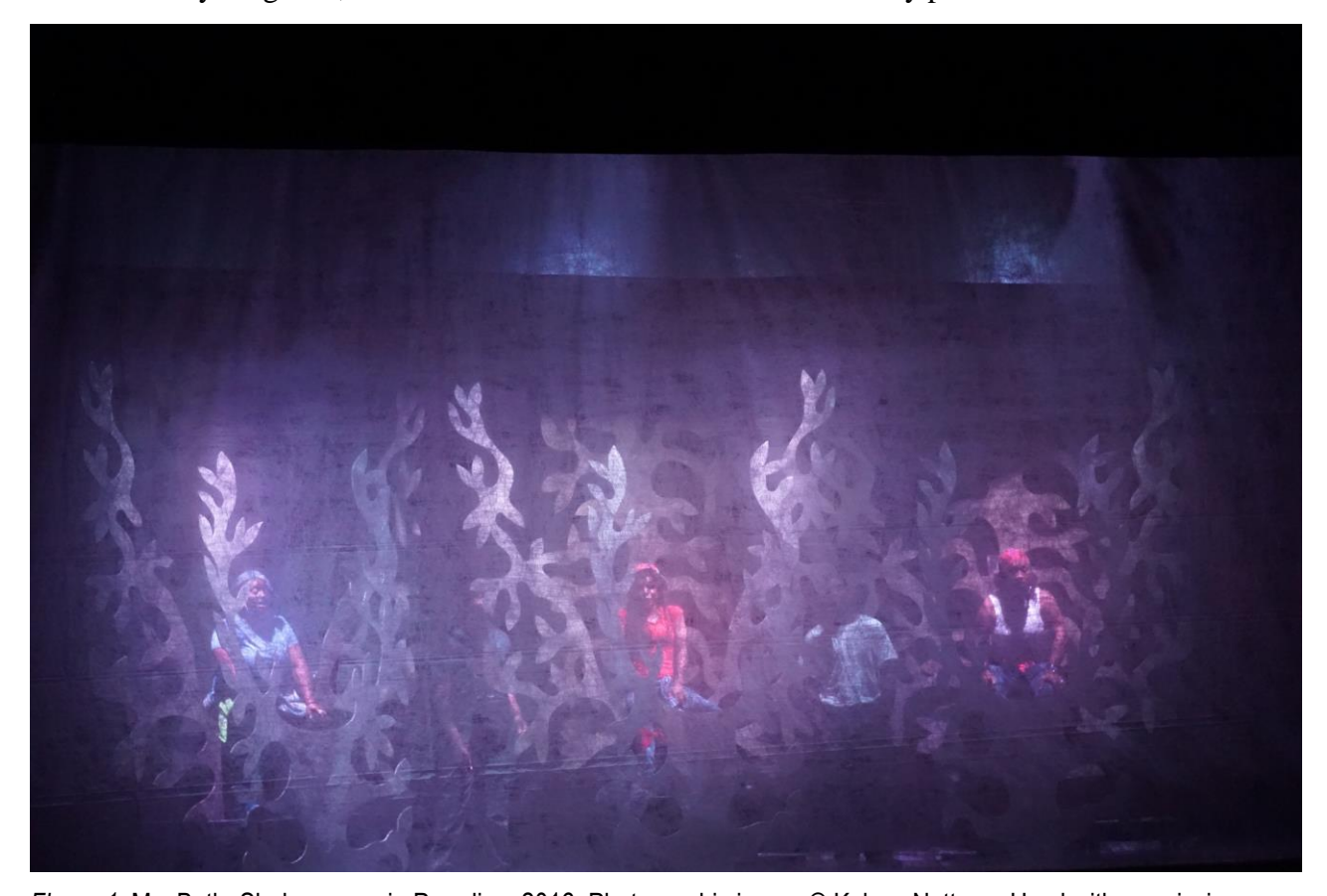
Figure 1. MacBeth, Shakespeare in Paradise, 2016. Photographic image © Kelsey Nottage. Used with permission.

of a hurricane. Long after fences were reconstructed, power lines repaired, window-panes replaced, and street signs restored, the incongruously autumnal bare trees and mounds of rotting foliage attested to the scars left by the storm. Macbeth's incredulity regarding the movement of trees seemed both resonant and eerily prescient.