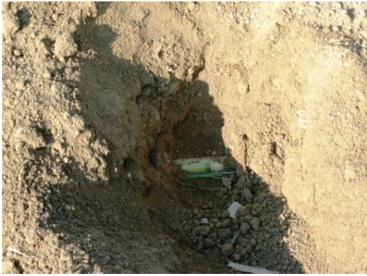
Figure 2. Culms planting at a depth between 200 and 250 mm

The member-machine involved in the following: opening and closing the furrows, burying the propagation material, and soil compacting, resulted to be well designed and efficient (Figure 2 and 3).