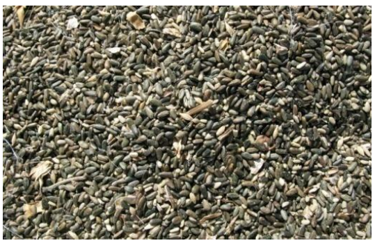
Figure 9. Seeds produced by heads threshing

The threshing system performed well when working only on heads. The percentage of seed impurities (Fig. 9) was 0.61%; the percentage of seed breakage was 3.25%.