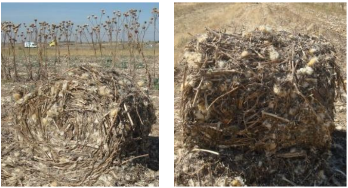
Figure 8a - 8b. Bales produced by New Holland 544 baler with stalks and threshing residues

Figure 7. Harvesting and baling of the windrowed biomass by New Holland 544 roto-baler with fixed camera equipped with pick-up