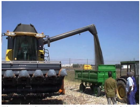
Figure 6. Seeds unload at the end of the proof

Flooding, rest times and inevitably dead times were not recorded. The performance was 84.25% of the operative time. This machine, operating at a speed of 1.23 m/s (4.41 km/h), performed well, at about 2.10 ha/h. The potential harvest is estimated to be 6.20 t/ha for biomass and 0.856 t/ha for seeds; hourly production is estimated to be 13.05 t/h for biomass and 1.50 t/h for seeds. Control values established on the combine harvester are the following: