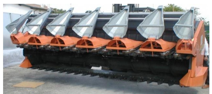
Figure 1. CRA-ING prototype built by Cressoni Firm: full-length mowing bar, in the low, and device operating on six-rows for stalks conditioning and detachment of the heads to be sent to the threshing system of the combine harvester, in the upper.

The developed prototype is the result of a fusion between two different head models. It combines the six-row maize head, placed in the upper, with the standard wheat head, in the lower part (Fig. 1). The first one serves to detach heads to be sent to the threshing system of the combine harvester, whereas the second one performs the mowing, the conditioning and the above-ground biomass windrowing among the combine harvester wheels. Residues derived from headthreshing are left on the windrow and the seeds are then harvested by the combine harvester.