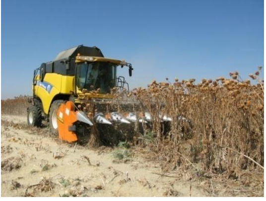
Figure 5. New Holland CX 8060 combine harvester equipped with Cressoni/CRA-ING Cynara Cardunculus head in harvesting phase

The combine harvester equipped with a head for Cynara Cardunculus (Fig. 5) displayed accessory times comprising a 12.10% time for turns and a 3.65% time to unload harvested seeds (Fig. 6).