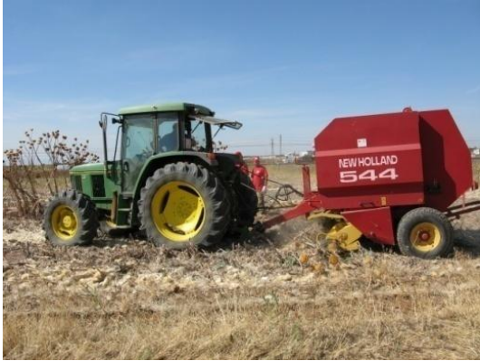
Figure 7. Harvesting and baling of the windrowed biomass by New Holland 544 roto-baler with fixed camera equipped with pick-up

In the subsequent baling phase (Fig. 7, 8a and 8b), conducted with a baling machine equipped with a pick-up, the accessory times comprised times for turns (5.88%), maintenance times (2.46%, mainly due to flooding of the feeding device compression chamber), and times for unloading bales (19%).