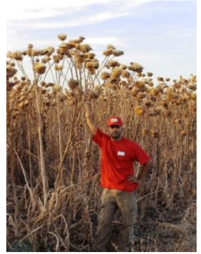
Figure 3. Well-developed area

Regarding the F1, F2, F3 and F4 zones (Fig. 4), the monitored Cynara crop area presented different growth levels. In this area, plant density (21.600 plants/ha) and stalk density (36.800 stalks/ha) seem to be slightly lower than in the previous area.