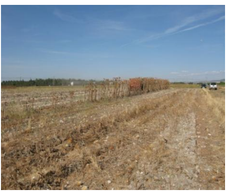
Figure 11. Ground with no biomass residues after the passage of the roto-baler