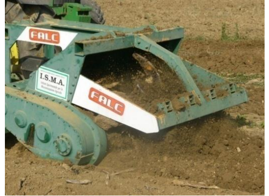
Figure 5. Particular of the modified Falc Land at work

theses), by the means of two harrowing if the crop planting occurs after winter.