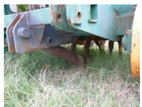
Figure 3. Particular of the CRA-ING innovations on the Falc rotative plow

In fact, the fixed blade, which is pliable during transportation (Fig. 3), can be lowered or lifted to different heights in the soil, and sits where the lances are activated in front of the support mast.