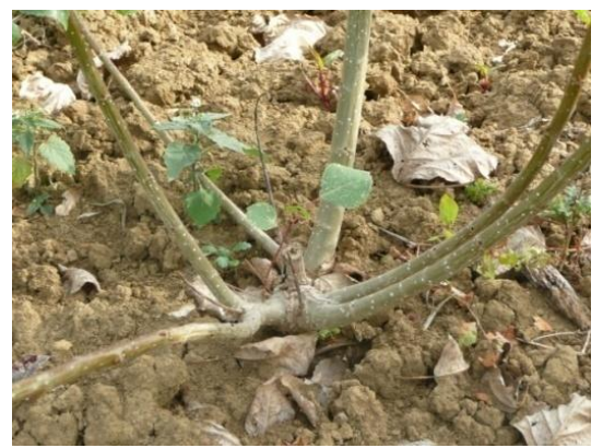
Figure 8. Particular of vegetative recovery of 1-2 thesis in autumnal planting

During the last survey on the autumnal planting, characterized by a mortality rate so high that it prevented cultivation growth, there was a considerable increase in the baseline stump (Fig. 8). This was probably due to the fact that the previous year's sprouts were on the ground, followed by vegetative recovery at neck level with a significantly enlarged baseline like a sort of felling lived by the plant.