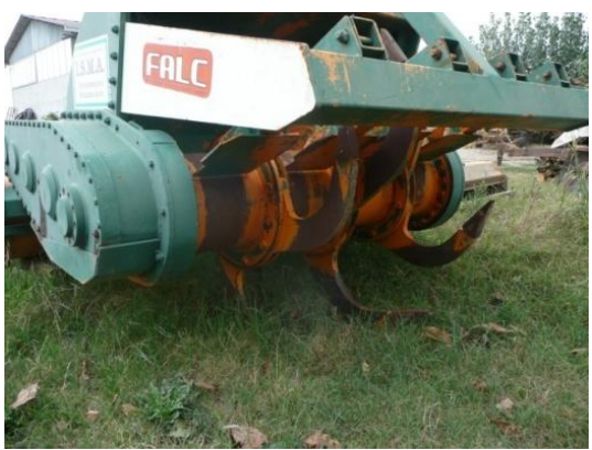
Figure 1. Rear view of the Machine Components

The original Falc Land 1500 was formed by a rollover plow supplied with 12 spears mounted on a horizontal axis in three fields, each of them made up of four axes. The sections were spaced 0.35 m from one to another, allowing for work on an area of 1.5 m. Two lateral parts allowed for a depth of 0.45, whereas the central section was 0.55 m deep (Fig. 1).