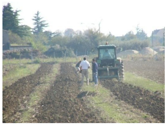
Figure 6. Trial field for autumnal planting

Immediately after the first plot's soil preparation (Fig. 6), four rows (375 m in length) for each clone (1 and 2 these) were transplanted, leaving nine (3 and 4 theses) grouped in four rows, in addition to another row at the end of the plot that had been transplanted at the end of the winter (February 2008).