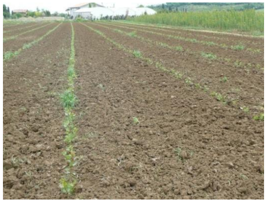
Figure 7. Spring planting after two months from cuttings transplant

The Figure 7 shows the prompt growing of plants post-winter planted, two months transplanting later.