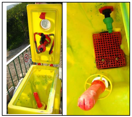
Figure 4. Chemical induction hoppers with pressure rinsing nozzles.