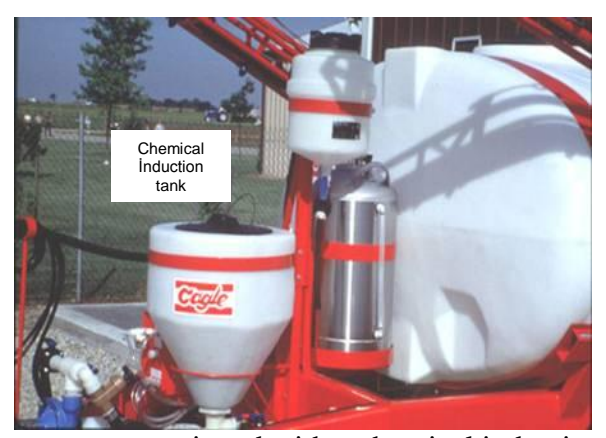
Figure 1. Modern sprayers are equipped with a chemical induction tank and several other smaller tanks.

Some of the recent research has focused on reducing the health risks that applicators face when handling pesticides. Findings of a recent study indicate that most of the applicator exposure to pesticides occurs while transporting, loading, and mixing chemicals. Older large sprayers required the applicators to climb up a stair to empty the pesticide container into the sprayer tank. This has created a huge physical safety risk as well as the risk of spilling the pesticides on the exterior of the sprayers and on the ground. Almost all the new sprayers manufactured by reputable companies today include a small induction tank (Figure 1) to mix pesticides into the sprayer tank. It is designed so that the unit is at a height that would not require the applicator to lift the pesticide container any higher than the waistline height. New sprayers also come with two more tanks which we did not used to see on older sprayers: a small clean water tank to wash hands and other body parts that may be exposed to pesticides accidentally; and a second, larger (100-150 L) tank that carry clean water to rinse interior and exterior of the sprayer in the field, away from the farmstead when the spraying is completed.