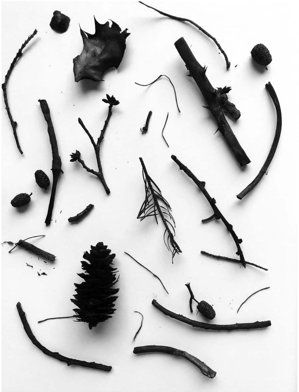
Natalie Purschwitz / Stardust process documentation, 2022 / carbonized plant matter