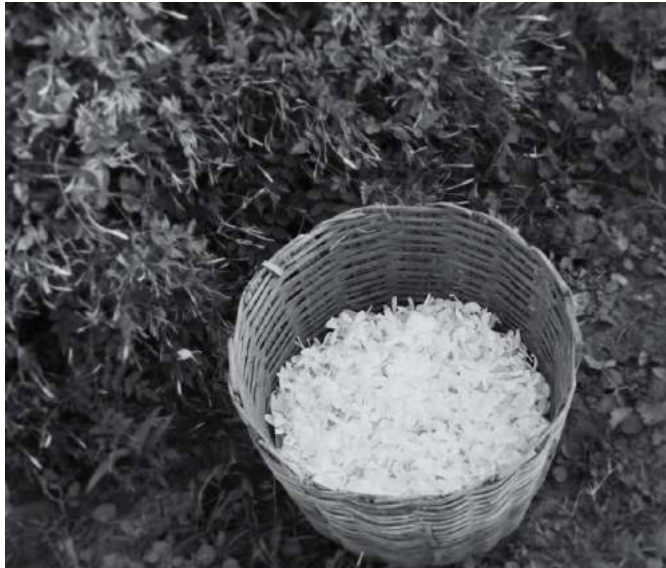
Cracher Dans La Soupe Parfum Jasmine petals being gathered for Cream Crush digital photograph 2018