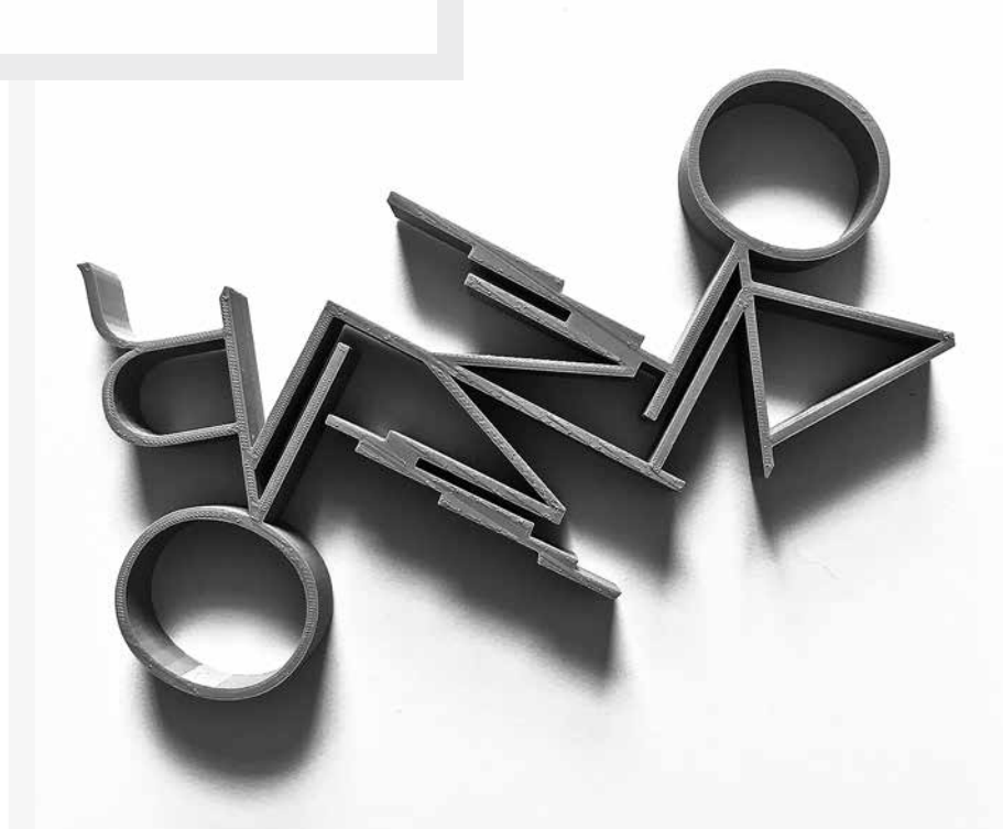
Eric Schmaltz, Information , 2018, biodegradable plastic filament, approximately 8 x 10 inches