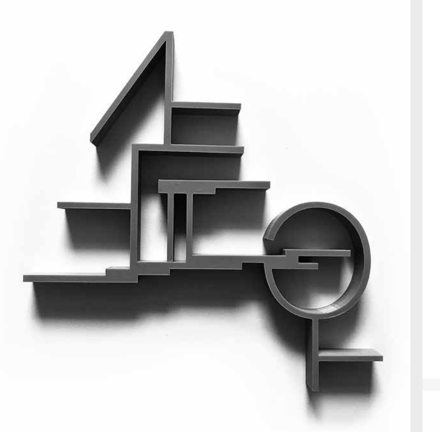
Eric Schmaltz, Feeling, 2018, biodegradable plastic filament, approximately 8 x 10 inches