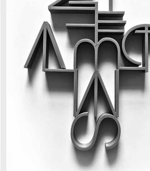
Eric Schmaltz, Semblance, 2018, biodegradable plastic filament, approximately 8 x 10 inches