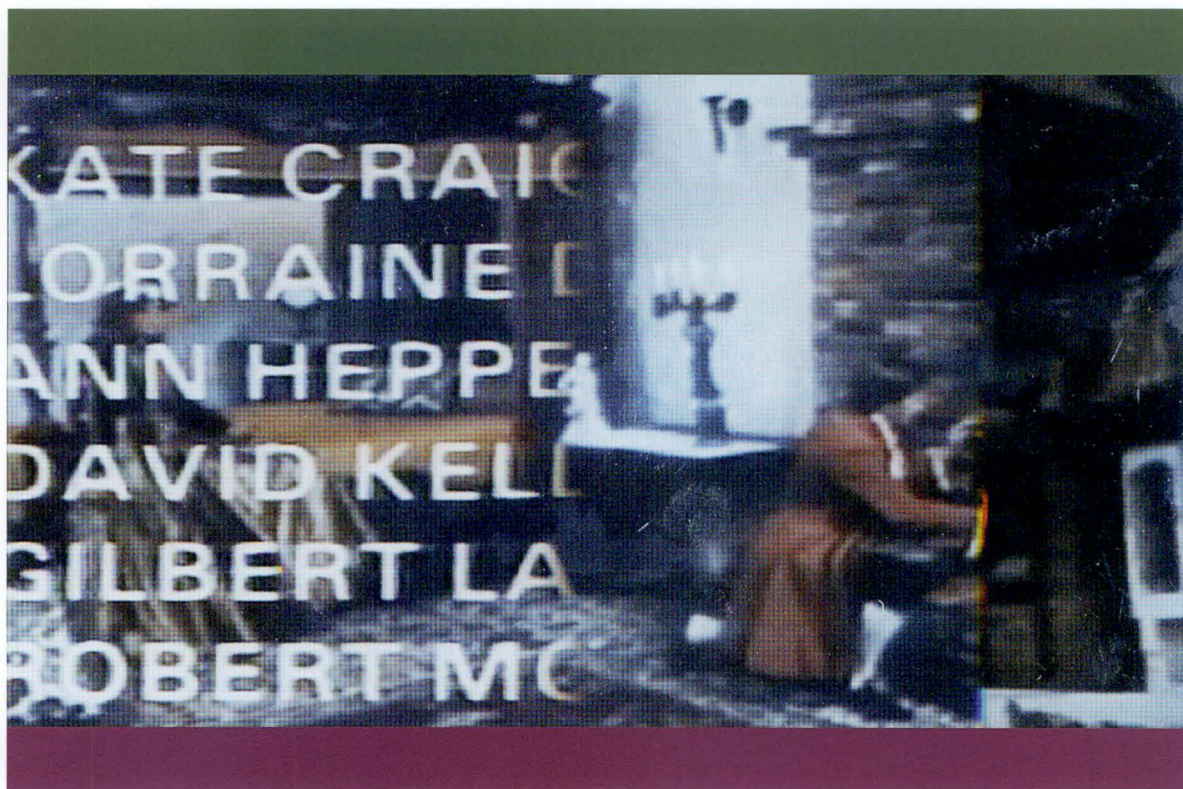
Raymond Boisjoly, Victoria Postcard , 2013, 56 cm × 84 cm.