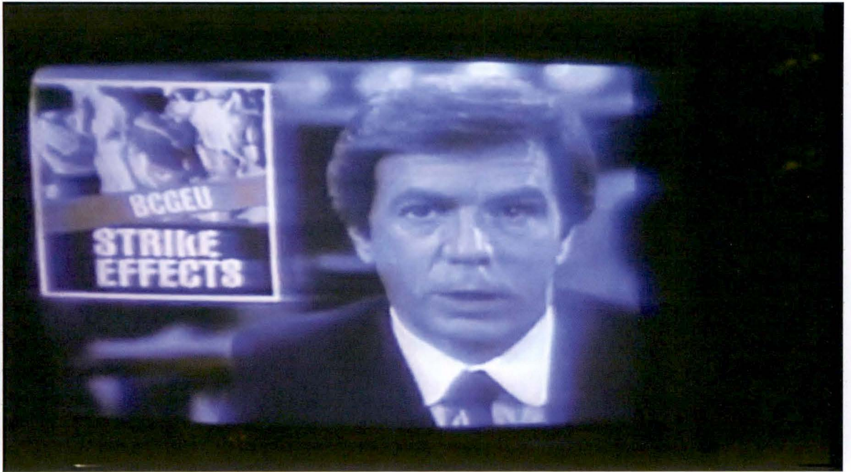
BCTV News reports on the latest negotiations between the provincial Social Credit government and the British Columbia Government Employer's Union over the former's proposed layoff of 1600 union members.