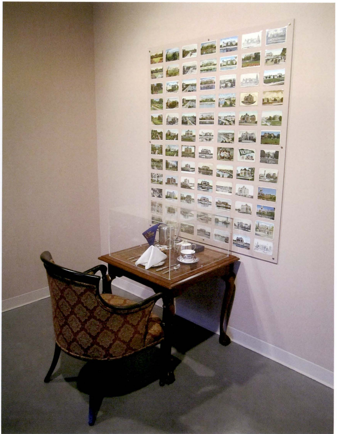
High tea place-setting and postcard array.