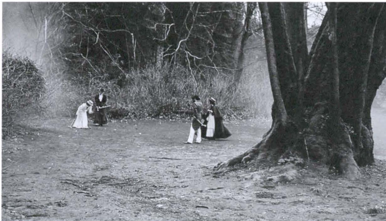
Karin Bubaš, Afternoon Croquet (Moodyville) , 2008, (still, original in colour) HD DVD projection, 16 minutes.