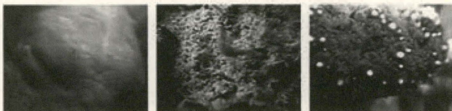
Screen shots from Interstitial , 2006

Interstitial is a work which deals with the fundamentals of existence: life and death. It does not attempt to sentimentalize nor deconstruct these issues. Death is death; life is life.