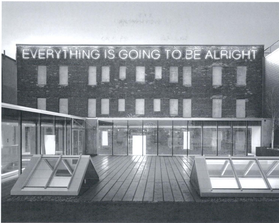
Martin Creed, Work No. 851 (2008) 51 East Pender Street (Wing Sang Building)