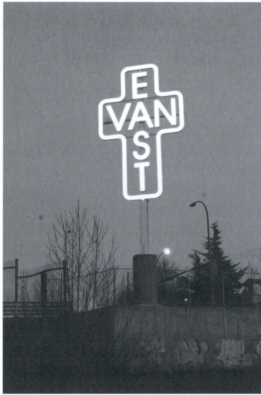
Ken Lum, Monument for East Vancouver (2010) Northwest corner of Clark Drive & Great Northern Way Photo credit: Ken Lum. Courtesy the City of Vancouver Public Art Program.

At 19.5 metres high, this concrete, steel, and neon cruciform stands at an East Vancouver intersection like Rio de Janeiro's Christ the Redeemer and is visible to those wealthy enough to afford cliff-top homes in West Van. Although widely-admired by those who live within the city's historic working class and immigrant east side, initial criticisms of this 2010 Winter Olympic commission focused on the artwork's Christian iconography, accusing it of reviving the WASP monoculture that flourished in Vancouver until the late-1970s. However, for those who grew up with this symbol written in felt pen inside Stanley Park toilet stalls or carved into bus stop benches in Kerrisdale, it is a mark of pride, one that traces the outward movements of those whose otherness is synonymous with their invisibility, something the artist experienced as a teenager every time he stepped from neighbourhoods like Strathcona or streets like Kingsway.