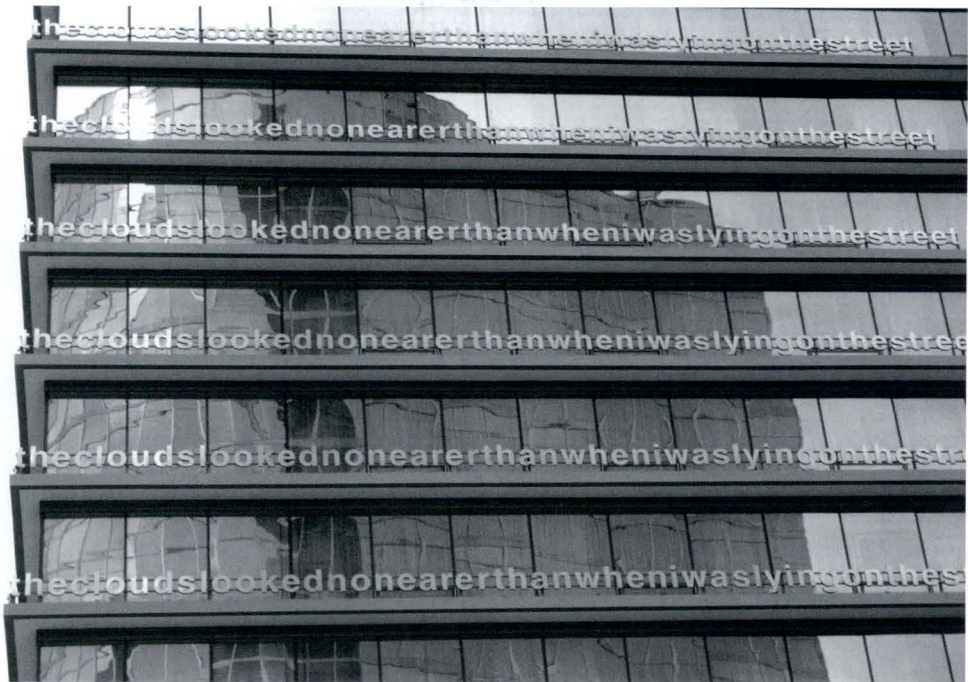
Liam Gillick, Lying On Top of a Building the Clouds Looked No Nearer Than When I was Lying on the Street (2009) 299 Burrard Street (Fairmont Pacific Rim Hotel)

This repeated text—a vertical extension of the floor plates between the fifth- and twenty-second storeys of an exclusive downtown hotel—presents itself as a koan but behaves closer to an apology for a building that obscures the clouds that its text has asked us to consider. While true that the height of this building is insignificant compared to the distance between the street and the clouds above, it is particularly insensitive to those who live in a city where “lying on the street” will get you arrested—to say nothing of a hotel whose security guards would accuse you of trespassing if they found you on its roof. Of course this is a literal reading, but to consider this British artist’s cummerbund text independent of the tuxedoed building that supports it is to mistake a ponderous thought for a passive-aggressive taunt.