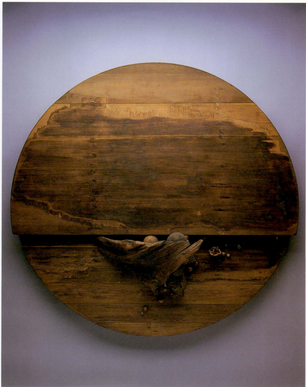
Goddess of the World