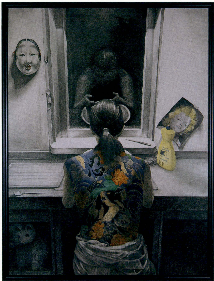
Haruko Okano: Irezumi of the West , graphite, coloured pencil and ink 30" x 40"