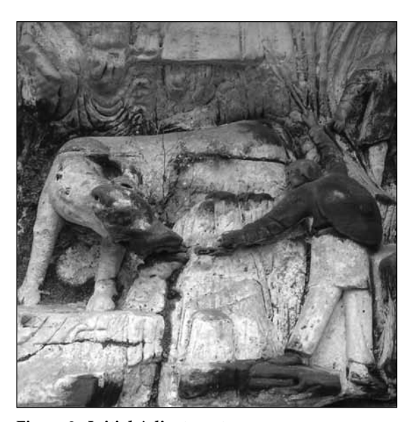
Figure 2. Initial Adjustments

mal, but it felt incredibly wild inside of me, comunmanageable, pletely and sitting still in this wildness was one of the most intense experiences of my life. I was also baffled by the people around me sitting perfectly still and quiet, showing no indication of any wildness lurking about. I left this meditation and instantly lite up a cigarette attempting to calm all this wildness that had arisen. This was the only way I knew how to tame my ox. None-