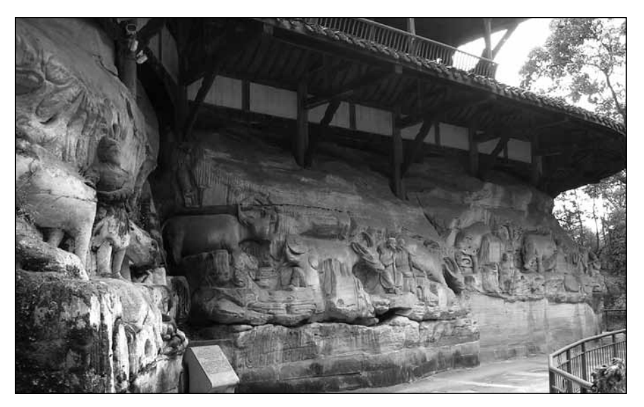
Figure 1. Oxhearding overview

around the mountainside of Dàfowan in awe. I was amazed at the scale, attention to detail, storytelling, and visceral effect of these Buddhist sculptures. Around one corner of the walkway, I was stuck by a series of oxherding pictures and verses(See Figure #1 ). Buddhist monk Zhào Zhìfèng carved this series of sculptures directly into the side of the mountain between 1179 and 1249 CE. <sup>16</sup> The ancient story of the ox and the herder can be traced back to the 3<sup>rd</sup> century BC, to the early Buddhist canon and the Agama scriptures. <sup>17</sup> Chan and Zen Buddhist scholars, teachers, and practitioners are continuously revitalizing these oxherding pictures and verses to convey the spiritual journey.