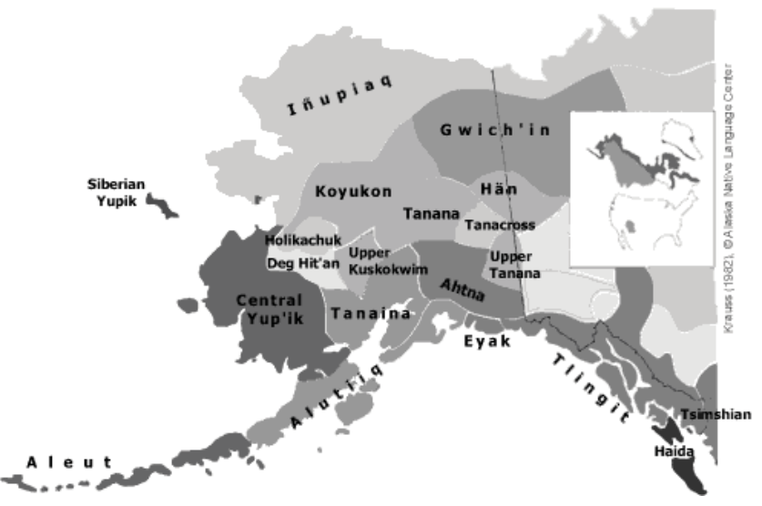
Figure 2. The Upper Tanana is one of several Alaska Native language groups in Alaska.