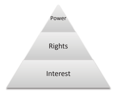
Figure 4. An Effective System.

and find mutually acceptable solutions (Costantino, 1996; Ury, Brett, and Goldberg, 1989).