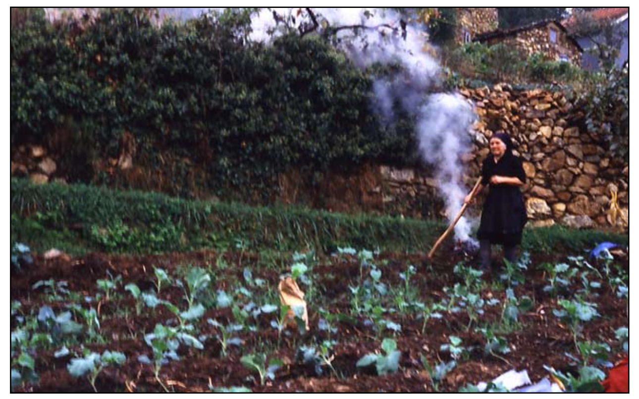
Figure 3 . Resident of Malho cultivating a terrace near the village. Traditional stone houses are evident in the top right. Note the line of thick green vegetation along the base of the soil retaining wall.

By contrast, the people who left this region for the cities three or more decades ago, have raised their children to young adults, imbued with warm feelings for their ancestral village, but ignorant of the culturally informed technology of their ancestors. Now these young adults return for a few weeks a year to "fix up" their newly inherited grandparents' holdings for holiday visits. Their bungling alterations function as experimental manipulations. These result in autecological evidence that reveal to me some of the more invisible aspects of their ancestors' culturally codified technology.