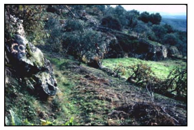
Figure 2 . Contoured terraces in Val Pasqual; between curving soil retaining walls and a thick grass strip runs an irrigation ditch evident in the lower left; the continuing grass strip is visible right center as darker green at the base of the wall.

aware of the cultural demise that would await their final years. "All of this was cultivated and planted," they would often tell me, gesturing to the terraces, then already 80% or more abandoned, with only a few plots still cultivated by old folks (Figure 3). When I returned in 1993, I could see that a fire had burned the heath lands, destroy-