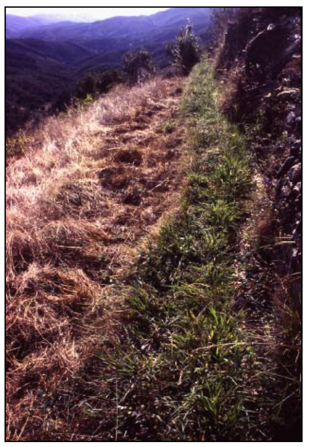
Figure 4 . Irrigation water running from its source to the terraces of Malho. It is directed along its path at the base of a rock outcrop by a ribbon of living grass mat on its downhill side.

The major irrigation ditches that carry water all year round from its source a few hundred meters up the valley, or from the most faithful springs within the terrace system itself, have ditch grass on their lower side where they pass over rock outcrop. When such a major irrigation ditch runs