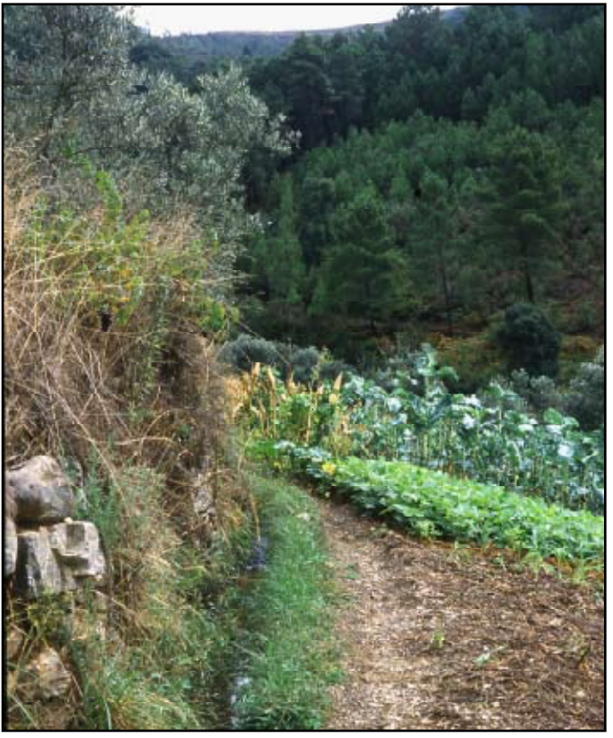
Figure 7 . Cultivated terrace; between the base of the soil retaining wall and a strip of thick grass is a small irrigation ditch in which water flows over bedrock and is held in place by the living grass strip.