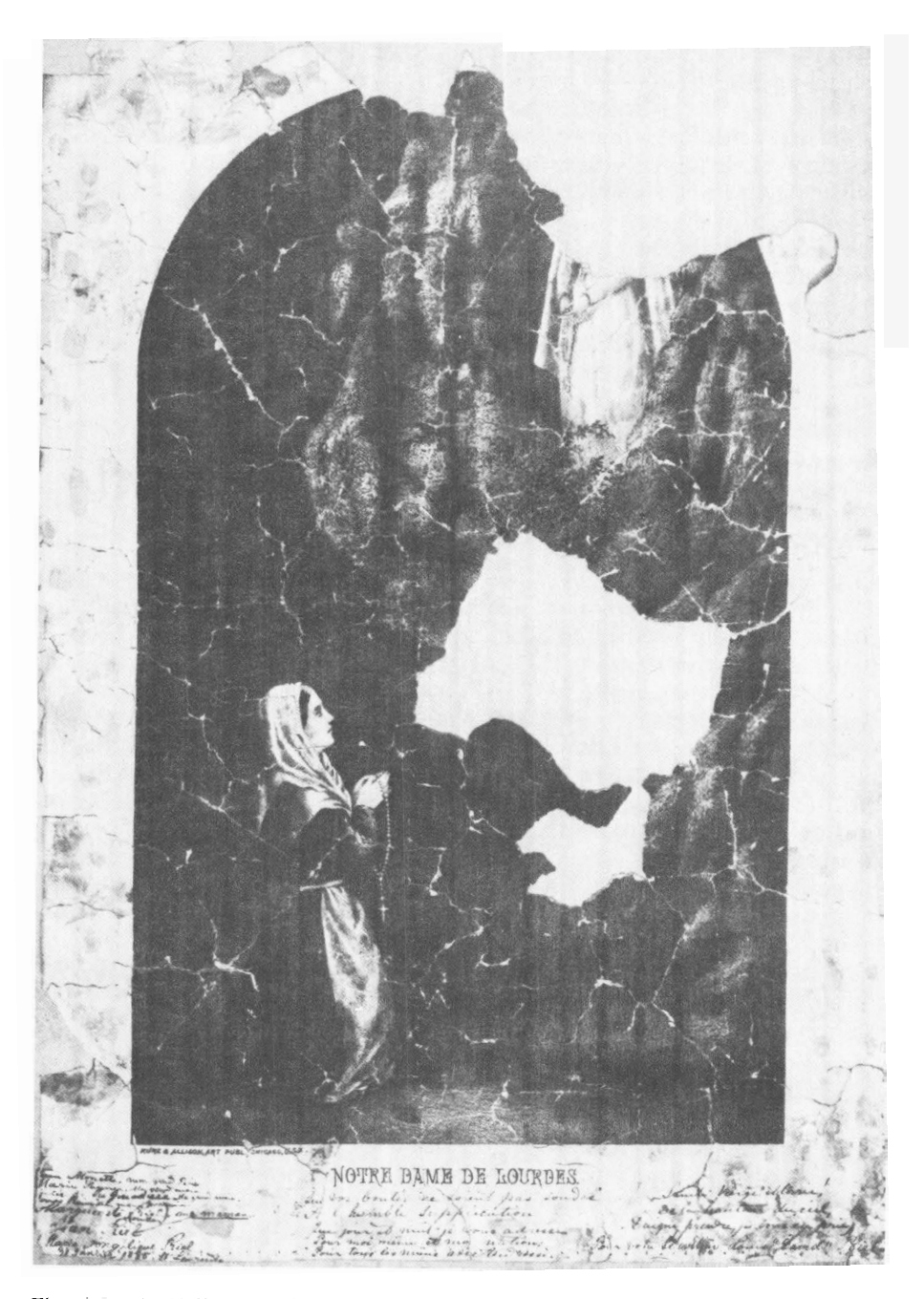
Fig. 4 Louis Riel's "Flag" in the North-West Rebellion of 1885. This image of Notre Dame de Lourdes seems to have been attached to a banner used by Riel at Batoche. The inscription at the bottom, in Riel's hand, contains a list of family members as well as a poem to Our Lady. Further poetry on the same theme is on the reverse side. (PAC, MG 27 I F 3, no. 49.)